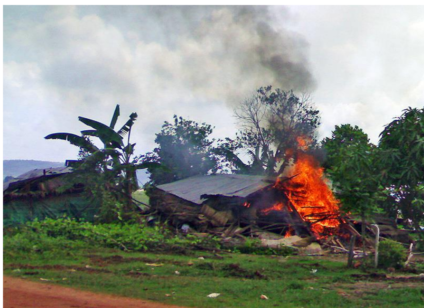
Up to 80 homes were set ablaze during the eviction.

As a result of the eviction, the families, mostly small-scale fishermen and beach vendors, lost most personal possessions, including their fishing nets and other equipment, as well as the shelter of a home. At the time of writing this report over 90 of the families have established basic shelters in very cramped conditions on the side of a road near their former village; they lack basic shelter, food, drinking water and basic sanitation as well as the means of earning a living. Many of the children are unwell with cold, fever or diarrhea.