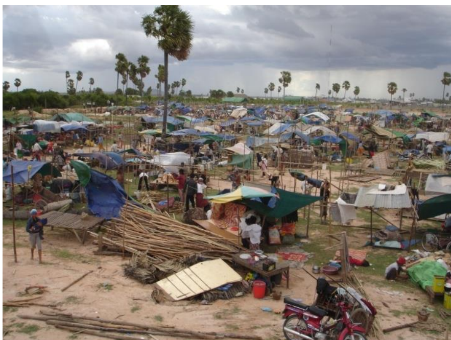
The resettlement site at Andong lacked all basic amenities.

Prior to the eviction, residents in Sambok Chap had not been informed about the details of the resettlement plan, and repeated requests from NGOs to the municipality for consultation and discussion about the eviction and relocation had been denied, as had efforts by NGOs to assess the true numbers of those who would be affected. 88