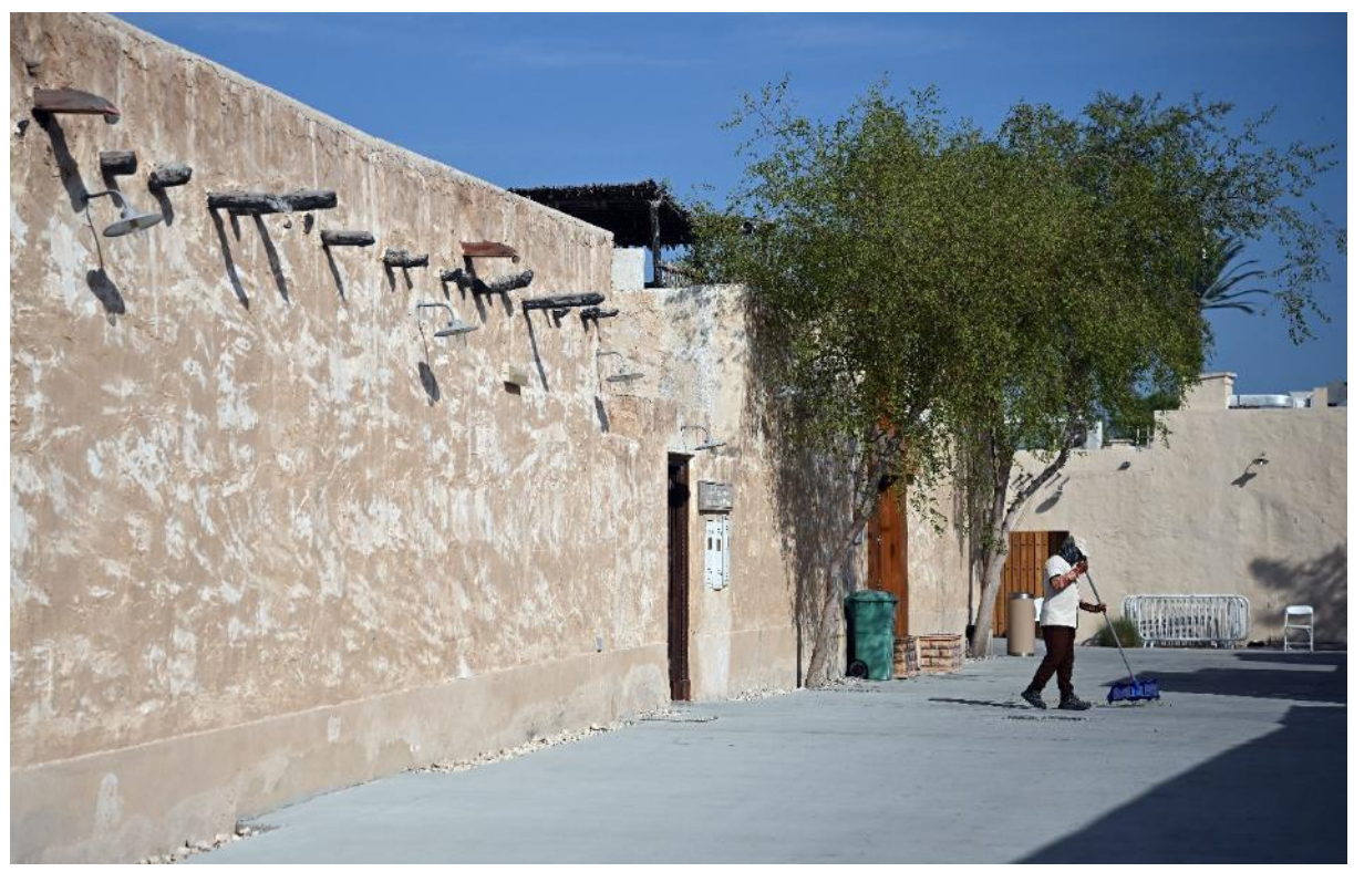
A cleaner sweeps the path near to the England team hotel, 10 miles south of Doha on November 12, 2022

The government told Amnesty International that in 2022 it had recorded a decrease in the number of people reporting to clinics with heat stress-related conditions and said that it would release data for 2023 in due course.<sup>69</sup> This had not been published at the time of writing so Amnesty International is unable to independently assess this. The government also highlighted that private security companies are obliged to implement strategies to protect their workers, but did not provide any detail on measures taken by the Ministry of Labour to ensure that outdoor security guards are adequately protected from the risks of heat stress. Further, several organizations including Human Rights Watch<sup>70</sup> and Amnesty International have long raised serious concerns about the large number of unexplained deaths in Qatar and the need for better investigation of these, while the ILO has also acknowledged the need to review the approach to collection of data around possible work-place deaths and injuries.<sup>71</sup> In late 2021, the Ministry of Labour and the Ministry of Public Health, signed a memorandum to cooperate on data collection.<sup>72</sup> However, Amnesty International is unaware of any steps yet to have been taken to improve the investigation of worker deaths, which could help prevent avoidable deaths and enable families who lost loved ones to understand what happened and claim compensation for their loss.