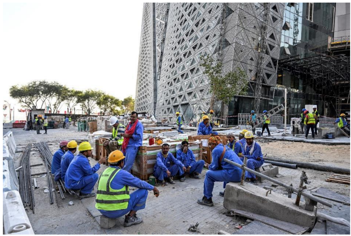
Migrant builders take a break while working at a construction site by the Corniche, in Doha, (Photo by CHANDAN KHANNA / AFP) @ AFP via Getty Images

As part of the data provided to Amnesty International regarding workers' applications to change jobs, the government provided Amnesty International with a list of reasons as to why it declined such requests, including, because new employers failed to comply with laws and permits needed to hire workers; the employer already had complaints lodged against it; or because the correct documents had not been uploaded with the application.<sup>31</sup>