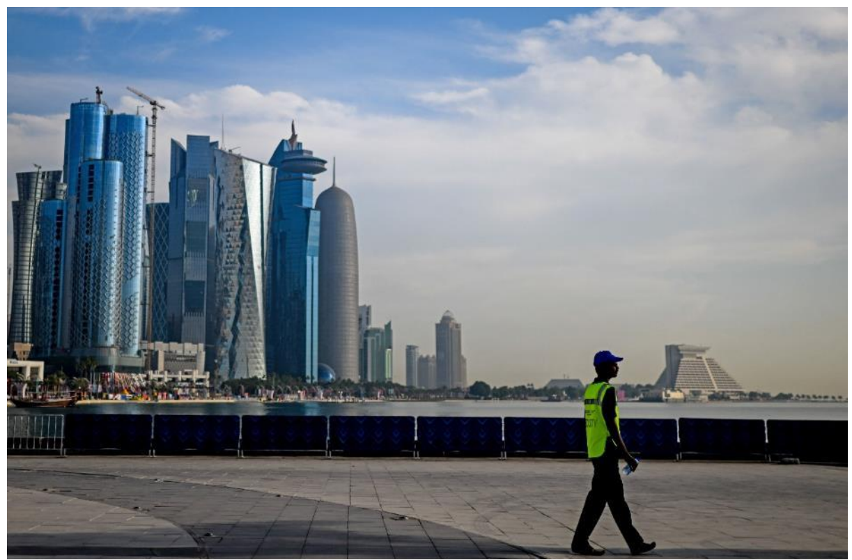
A security guard walks at the West Bay in Doha on November 30, 2022, during the Qatar 2022 World Cup football tournament.