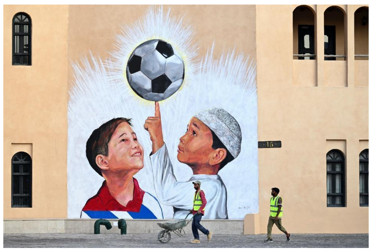
A worker pushes a wheelbarrow past a mural in Doha on November 8, 2022, ahead of the Qatar 2022 FIFA World Cup football tournament.

that the vast majority of labour complaints are 'settled in mediation', it does not provide further information about what this means in practice and what proportion of these result in migrant workers receiving their full dues.