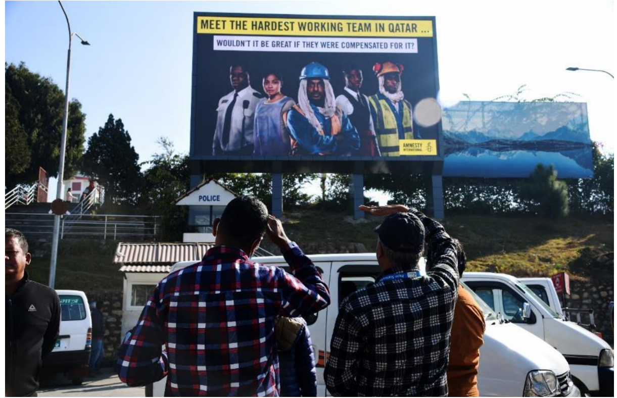
Pay Up FIFA Billboard outside Tribhuvan International Airport in Kathmandu, Nepal, December 2022.

Until 2020, Qatar's inherently abusive kafala sponsorship system imposed tight restrictions on migrant workers' freedom of movement, prohibiting them from leaving the country or changing jobs without the permission of their employer. Between 2018 and 2020, the government took important steps towards tackling two central pillars of this system by repealing for most migrant workers the requirement to obtain from their employer an 'exit permit' to leave the country, and a 'no-objection certificate' (NOC) to change jobs.<sup>25</sup>