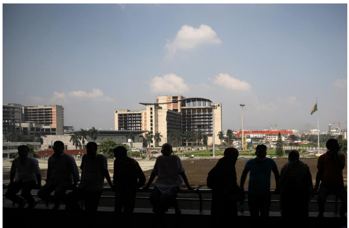
Migrant workers waiting outside Hazrat Shahjalal International airport in Dhaka, Bangladesh on Tuesday, September 26, 2021.

To combat low wages the government introduced a monthly minimum wage in 2021 which, albeit still very low, increased salaries for tens of thousands of workers. It also took steps in recent years to tackle persistent cases of wage theft by strengthening its Wage Protection System (WPS) to better monitor payment of salaries and deter businesses from late and non-payment of their employees. Nonetheless, wage theft remains the most common form of exploitation facing migrant workers in Qatar according to stakeholders interviewed by Amnesty International for this briefing.