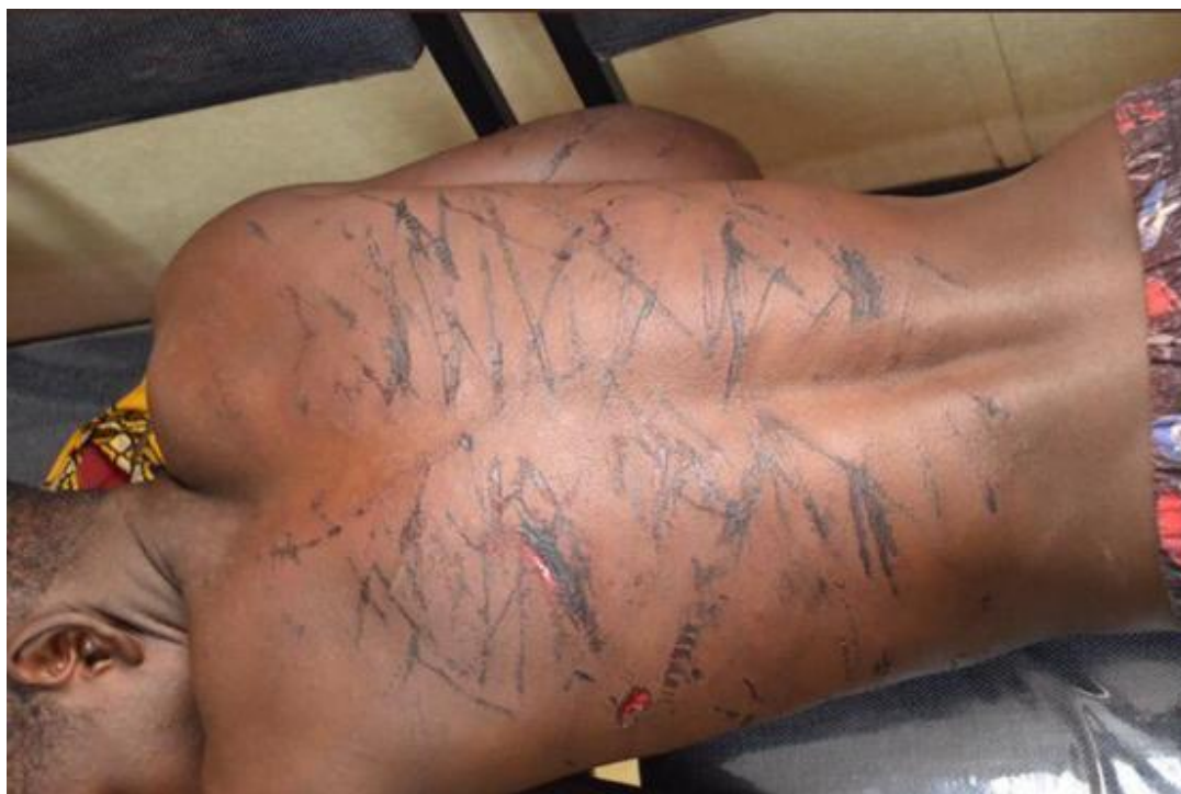
A man shows the injuries he sustained following severe beating by soldiers

Amnesty International has also seen and verified the authenticity of over a dozen pictures and footage of victims who reported that they were tortured. In one instance, on 15 January in Mabvuku, a group of about six men entered a house and said they were looking for two men. They found two women sleeping and they started beating them with batons as they asked them to tell them where their husbands were. One of them sustained broken legs. On 21 January, a 25-year-old male was severely assaulted by soldiers using a sjambok in Kuwadzana. He sustained trim line bruises and lacerations consistent with sjamboks.