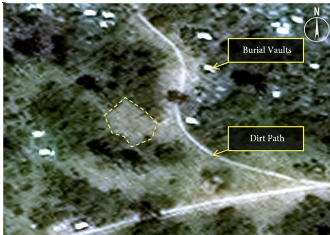
Satellite image shows undisturbed earth in early November 2015.

Video analysis identifies five separate graves within a larger area of disturbed earth. Judging by satellite imagery dating from 22 December 2015, the approximate size of the whole area is 49 m 2 . The analysis corroborates testimony describing five graves.