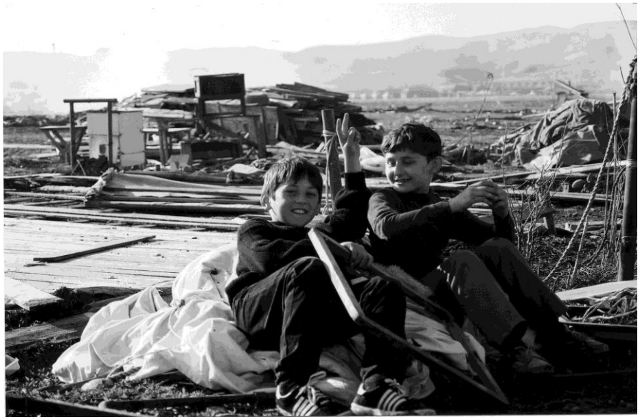
Two boys play in the ruins of the former tent camp for IDPs, Sputnik.

authorities will apply more pressure on the tens of thousands of Chechens who remain in spontaneous settlements or private accommodation in Ingushetia, to go back to Chechnya.