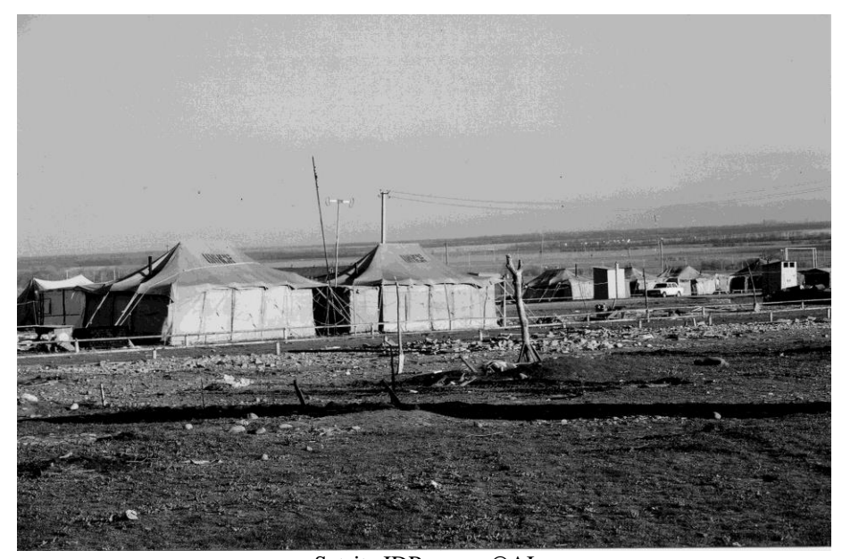
Satsita IDP camp.

Another person told Amnesty International delegates that in early 2000 he had been detained in the so-called filtration camp Chernokozovo for 57 days, where he was tortured. He has nine children and when he was released from Chernokozovo he was told by the guards to keep quiet about what he had experienced, otherwise his children would suffer. He was living in Satsita in April 2004 without any registration as an IDP<sup>22</sup> and sharing a tent with a befriended family, in order not to have any dealings with the authorities. He said as long as the armed conflict continues and as long as there is no justice in Chechnya he cannot live there.