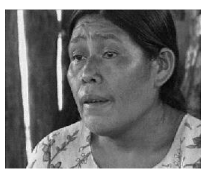
"I saw them burn my home and it hurt me. I cried when I saw them burn all my clothes. I now only have what I am wearing."

In the early hours of 5 May 2004, over 500 police officers came to evict the families. The community was not notified of the exact day of the eviction. Community members described how the police began by firing their weapons and tear gas into the air and then advanced on the homes. The community fled in fear for their lives. One woman (see photo below) said after the eviction: