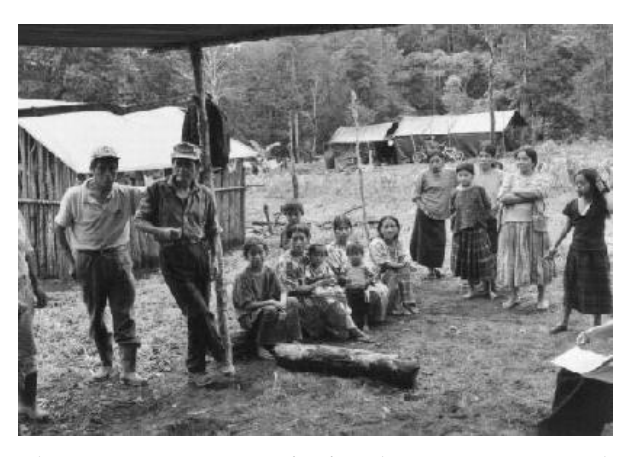
The Santa Inés community in Alta Verapaz returned to the area after being evicted on 7 July 2005

In 2001 some 15 families established themselves in Santa Inés, claiming that the land had been vacant for 40 years. Soon after their arrival, however, a local landowner, who owns seven different pieces of land in the surrounding area, claimed ownership of the same land. Subsequent investigations by three different government agencies confirmed that she was in fact occupying land that did not belong to her.