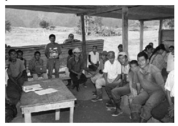
Q'eqchi indigenous rural workers who were evicted in May 2004 from the Chitocán farm in May 2004 photographed in their new community "New Israel" (Choctún) for which they still have no formal title.

community, lawyers representing the farm owner threatened them with another eviction if they did not accept the offer. The families agreed and moved into the Choctún farm on 21 May 2004. The agreement stipulated that government agencies would fund the land purchase.