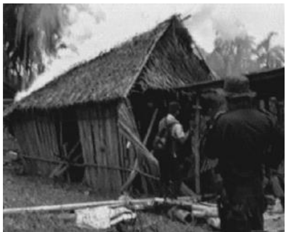
During the eviction police set alight to the communities homes