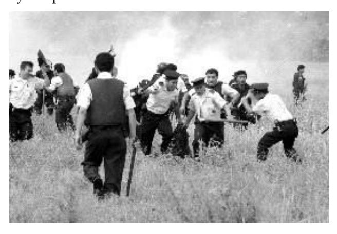
Photographic evidence taken by journalists shows police officers beating a campesino

The first line of police was unarmed. As they advanced, three policemen were shot and killed in disputed circumstances; another policeman later died of his wounds. Eight campesinos, including three minors, were also killed. Campesinos as well as journalists covering the event were beaten and threatened by police agents. Several journalists also had their video seized after allegedly cameras filming extrajudicial executions and beatings by police. All the homes, including contents, were burned by the police.