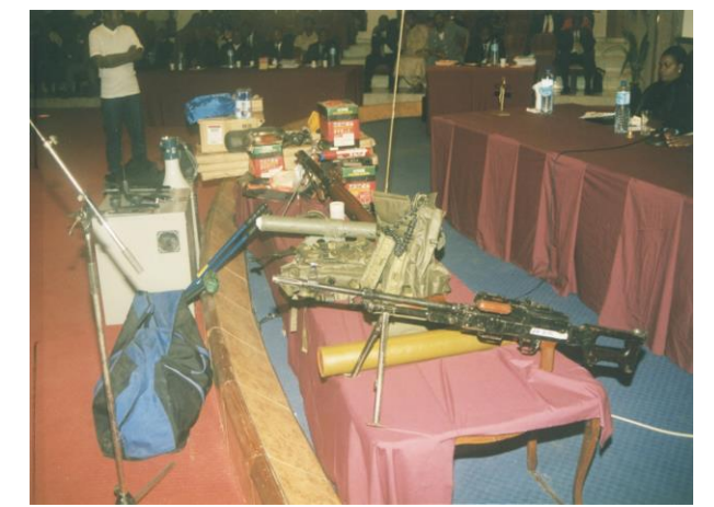
According to the authorities these were examples of weapons the "mercenaries" were going to buy in Zimbabwe

Importantly, the prosecution failed to produce in court the key piece of evidence it deemed most vital, on which most of the case rested, namely, the contract between Severo Moto Nsá and Simon Mann. The prosecution claimed that the original contract was kept in a safe in London and that only a photocopy was available in Equatorial Guinea. However, not even the photocopy was presented in court.