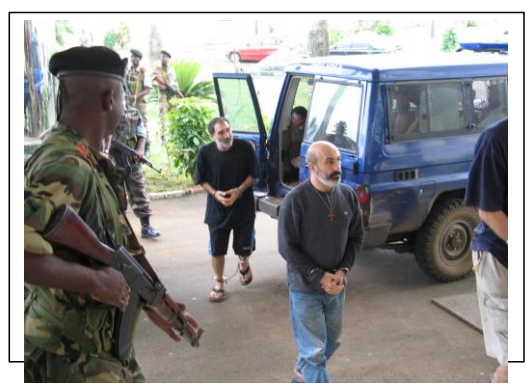
Defendants arriving at the courtroom

The defence counsel consisted of about 10 lawyers, all freely chosen by the defendants. The defence lawyers were not given adequate time to prepare their defence and, despite repeated requests, they were not allowed to see their clients until 20 August, a Friday, three days before the trial began. Moreover, they did not have access to the whole indictment, and only received the charge sheet and the statements in Spanish signed by their own clients. They did not have access to the other defendants' statements, or the evidence offered by the prosecution against their clients. Amnesty International is aware of veiled attempts to intimidate the defence counsel. The organization was informed that on 19 August the defence lawyers were called to a meeting in the Ministry of Justice where, in the presence of the Dean of the Bar Association and the Attorney General, they were told by the Second Vice- Prime Minister - who is in charge of human rights - to be "patriotic".