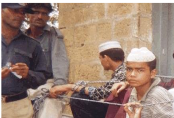
Alleged child offenders awaiting trial in Pakistan.

Although most of the outstanding death sentences imposed on child offenders before July 2000 have now been commuted, an unknown number of sentences are still outstanding while the courts determine the age of the convicted prisoners. Child offenders continue to be sentenced to death, mainly because their age has not been determined. The issue of age is generally not raised by the family’s legal counsel until a child has been sentenced to death. Often judges do not raise the issue of age unless the child looks like a minor. 12