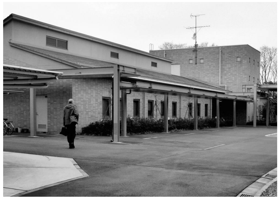
© Al. Tokyo Forensic Unit is one of more than 30 such units throughout the country established to allow for the evaluation of the mental health of detainees. The majority of residents in the Tokyo Forensic Unit are diagnosed with schizophrenia.

The policy also affects families of death row prisoners who are not told of the execution until after it has occurred. In one case, a mother arrived at the prison to visit her son to be told to come back later. When she did, she was told that he had been executed. 101 Again the rationale for this cruel policy is explained in benevolent terms for both family and prisoner: