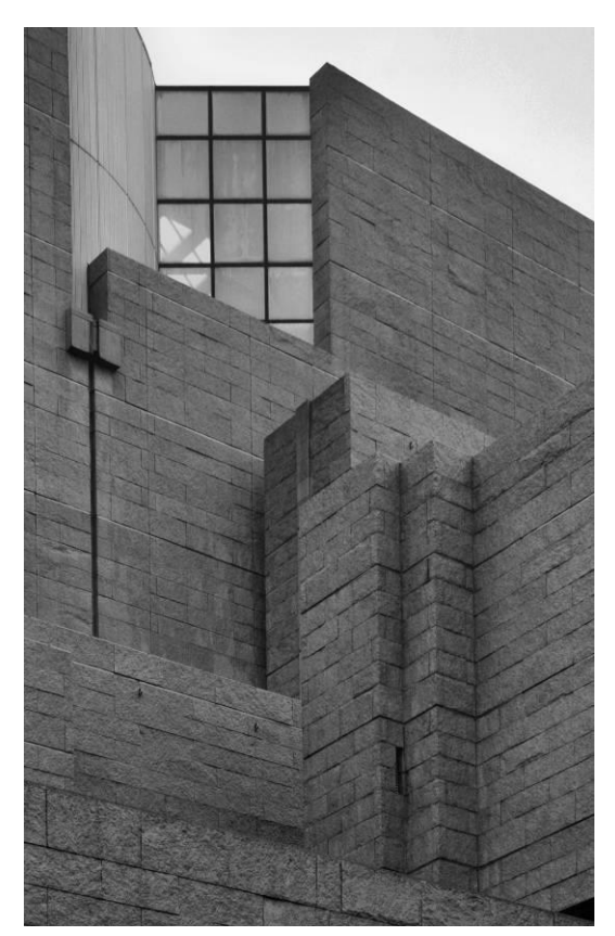
© Al. The Supreme Court of Japan, Tokyo. Death sentences are initially imposed by the court of first instance, the District Court, where the case is first heard. On appeal, the case transfers to the High Court and final appeals are heard in the Supreme Court.

balance between the crime and the punishment as well as that of general prevention, taking into account ... the nature, motive and mode of the crime, especially the persistence and cruelty of the means of killing, the seriousness of the consequences, especially the number of victims killed, the feelings of the bereaved, social effects, the age and previous convictions of the offender, and the circumstances after commitment of the crime." 44