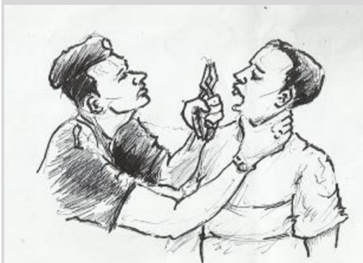
Figure 2 - An artist's drawing portraying a tooth being extracted by a police officer. © Chijioko Ugwu Clement