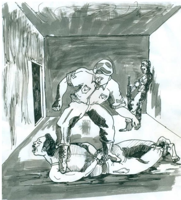
Figure 6 - An artist's drawing depicting Ahmed's account. © Chijioke Ugwu Clement

Many of my colleagues did not make it [died in detention]. The beating, the torture was just too much for us. They do all types of things to you, the soldiers. They will tie your hands behind your back, with the elbows touching and then one of them will walk on your tied hands with their boots. Your hands will remain tied and then they'll pour salt water on your wounds. You can't rub it, even if it goes into your eyes. My eyes got swollen as a result of that. I thought I was going to be blind. I have never experienced such brutality in my life.” 23