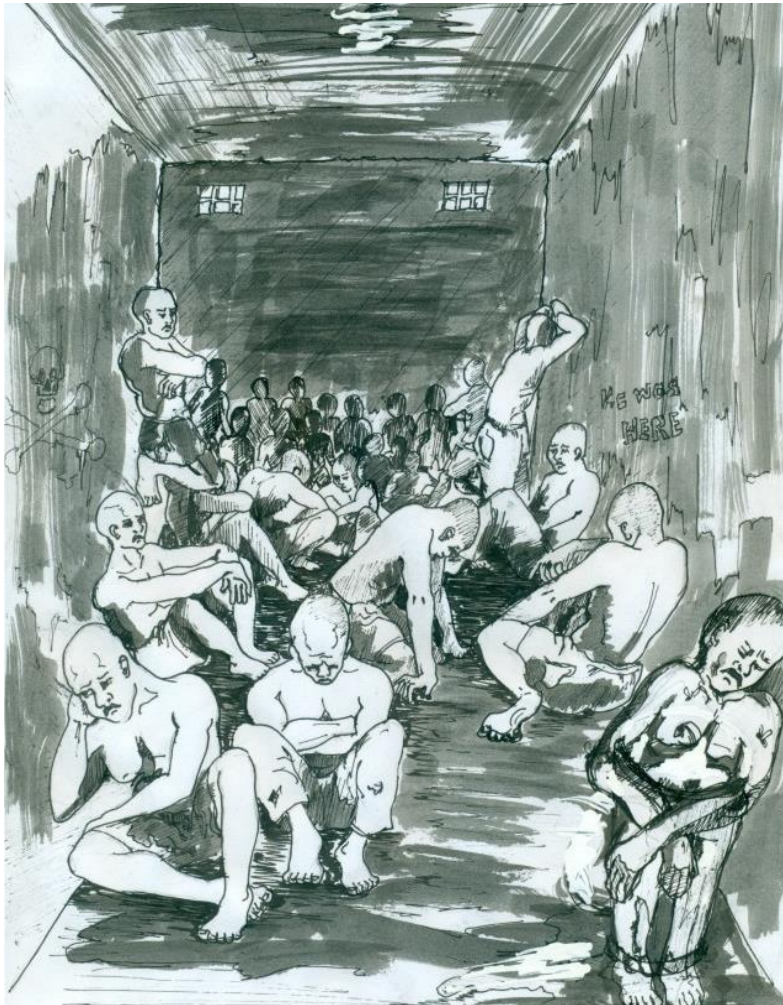
Figure 11 - An artist's drawing depicting Mustafa's account. © Chijioko Ugwu Clement

detainees were often allowed out of the rooms throughout the day, returning to their cells at 6pm.