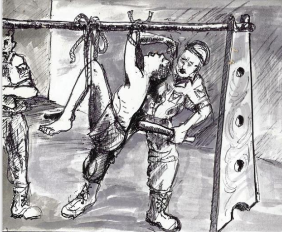
Figure 3 - An artist's drawing depicting a detainee

being suspended upside down by their feet. © Chijioke Ugwu Clement