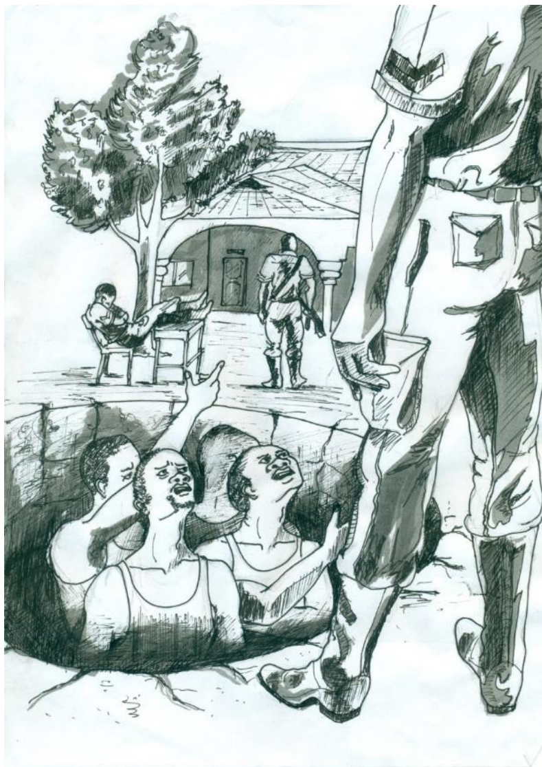
Figure 7 – An artist's drawing depicting Musa's account. © Chijioko Ugwu Clement

Detainees transferred or held at the main military detention facilities are commonly held incommunicado without charge or trial for varying periods, some for over two years, often in conditions that amounted to enforced disappearances.