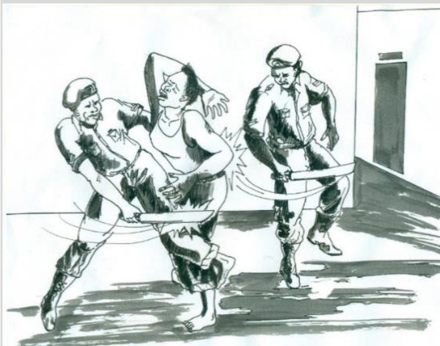
Figure 1 – An artist's drawing portraying a beating with machetes. © Chijioko Ugwu Clement