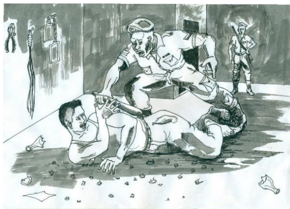
Figure 8 - An artist's drawing depicting Mahmood's account. © Chijioke Ugwu Clement

other detainees being extrajudicially executed.