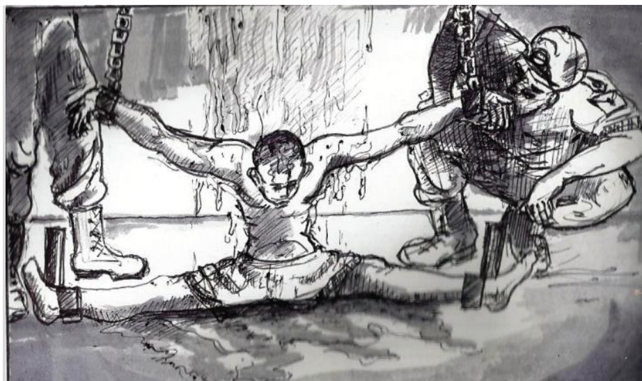
Figure 5 - An artist's drawing portraying 'water torture'. © Chijioke Ugwu Clement

Some former detainees have also described other forms of abuse that may violate the absolute prohibition of torture and other ill-treatment, including experiencing mock executions and being forced to watch other people being extrajudicially executed. As a result of increased scrutiny by human rights non-governmental groups, Nigerian human rights organizations have reported new methods of torture aimed at hiding visible marks on the body of victims. This include covering the ropes used in tying up suspects with cloth to avoid any mark on the body; and tying the upper arm of suspects with rubber to choke the flow of blood and covering detainees with plastic and placing them in the sun until they die.