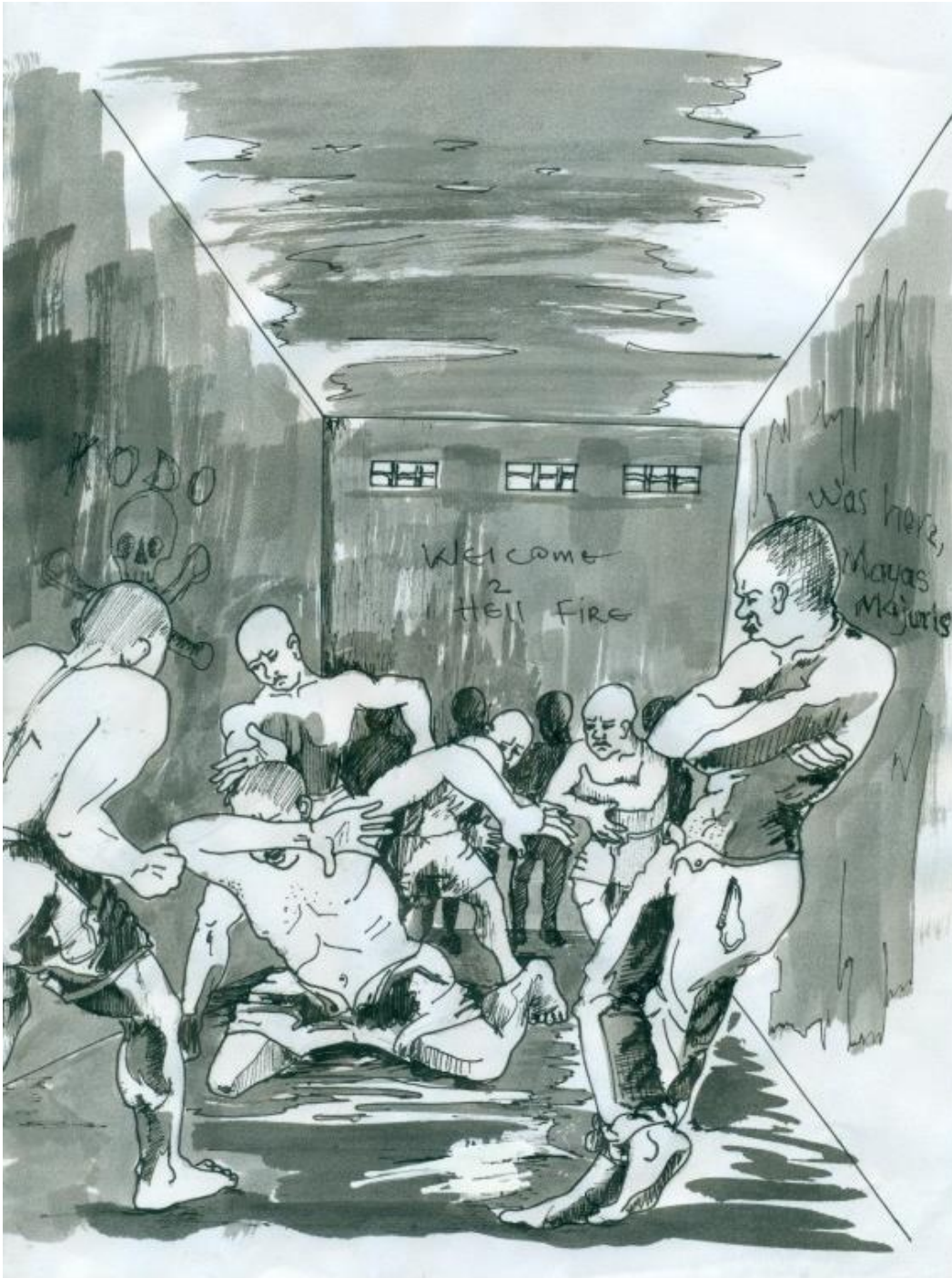
Figure 9 - An artist's drawing depicting Chinwe's account. © Chijioke Ugwu Clement

the wall. There were visible signs of blood in the gutter. The situation was similar during a second visit in October 2012.