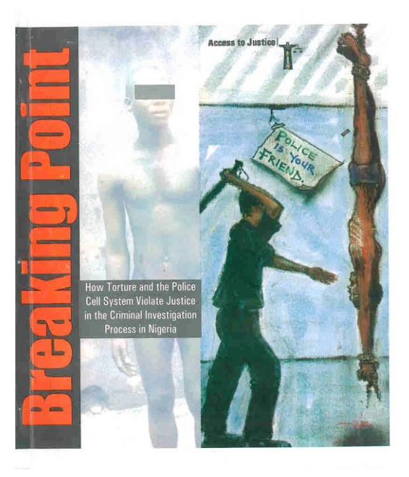
Access to Justice publication: 'Breaking point'

The Nigerian government is aware of the use of torture but cites challenging circumstances in the country as an explanation. For example in September 2007 the former Minister of Foreign Affairs Ojo Maduekwe wrote to the UN Special Rapporteur on Torture: " While the