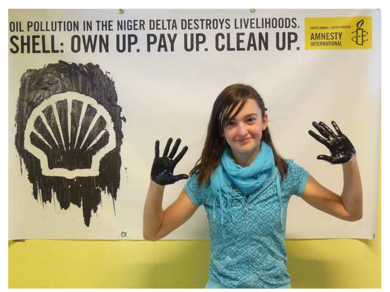
Student taking action on Shell: Own up. Pay up. Clean up, Liceo Norberto Rosa, Italy.

On the 14 and 31 March 2012, students from the Human Rights Friendly School Liceo Norberto Rosa took action on Corporate Accountability to help stop Shell's corporate abuse of human rights in the Niger Delta. The 'Shell: Own up. Pay up. Clean up' action highlights the failure by the oil industry to properly clean up oil spills and other pollution in the Niger Delta region of Nigeria, which leaves people exposed to sustained violations of their economic, social and cultural rights.