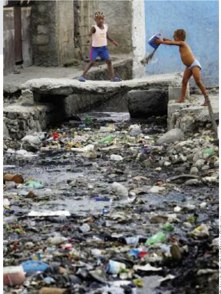
A child crosses a footbridge above an open sewer while another throws rubbish into it in the Cité Soleil slum, Port-au-Prince, Haiti.