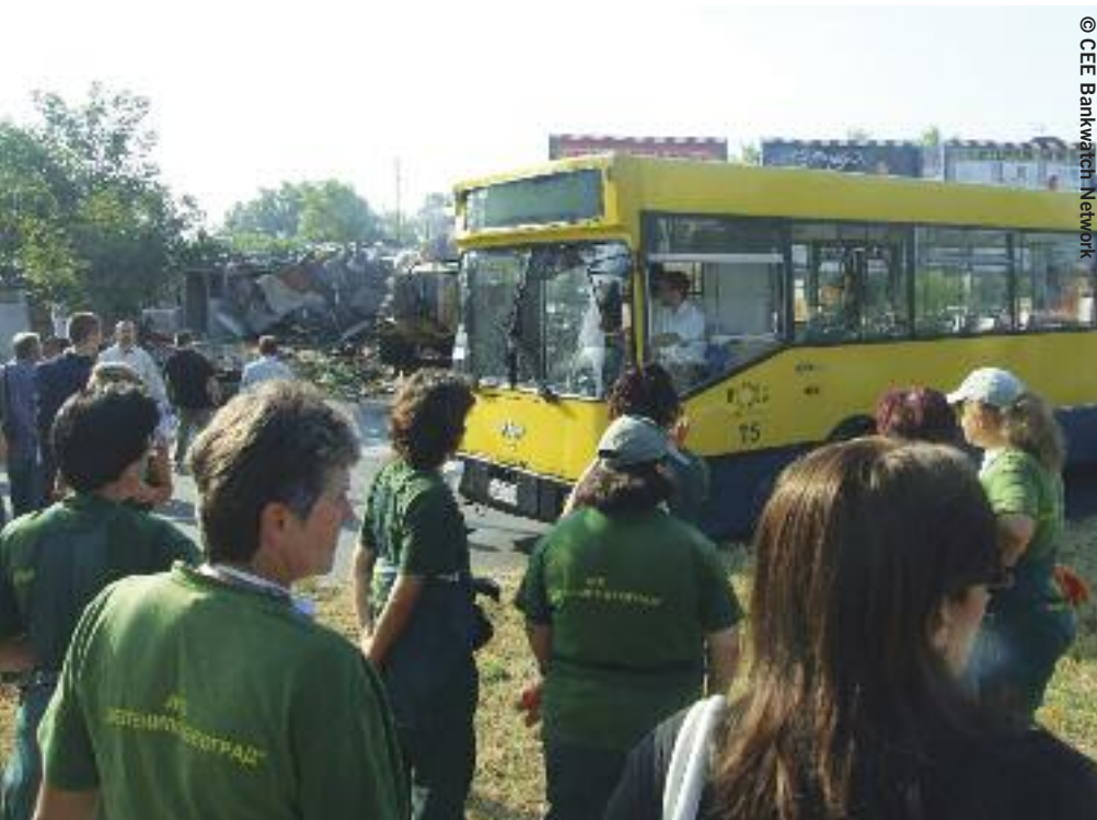
© CEE Bankwatch Network © Amnesty International