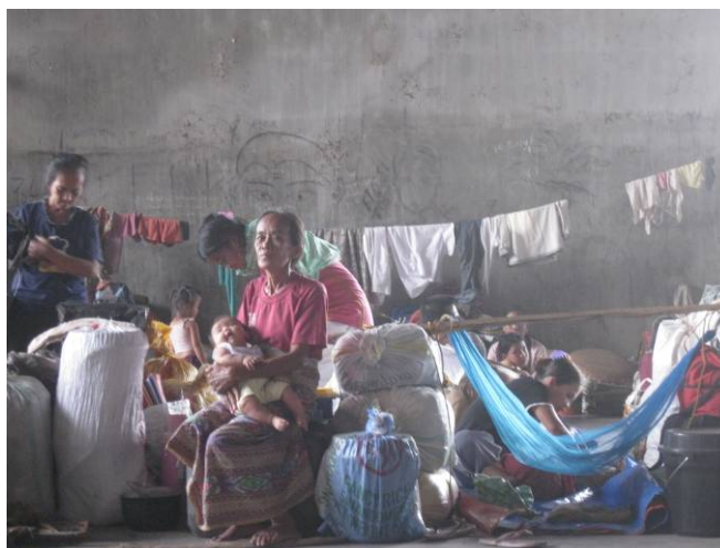
Figure 9: Displaced people in Buisan Evacuation Centre in North Cotabato province

Those that stayed indoors in the rice warehouses or gymnasiums slept on the cement floors, using discarded rice sacks or salvaged blankets for their bedding. Other sites included Islamic schools, mosques, beach resorts, an old municipal building, an old market and a hospital.