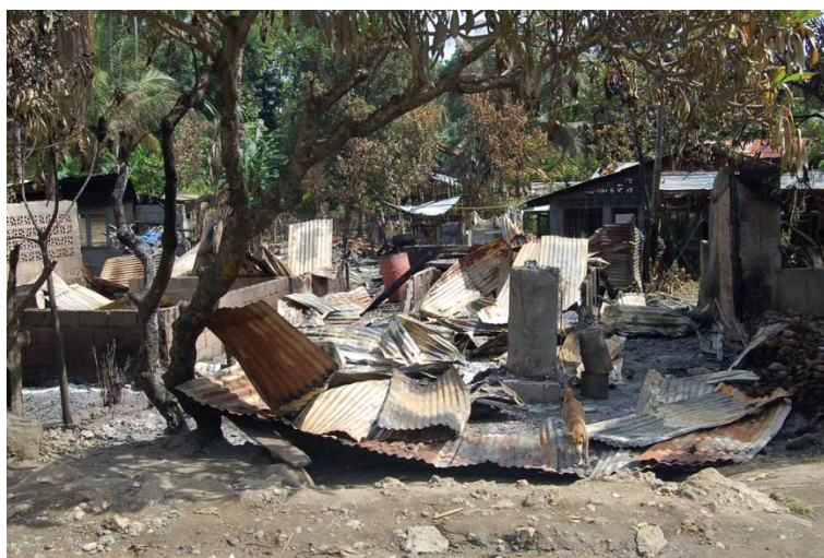
Figure 19: Remains of a burned school in Lanao del Norte province