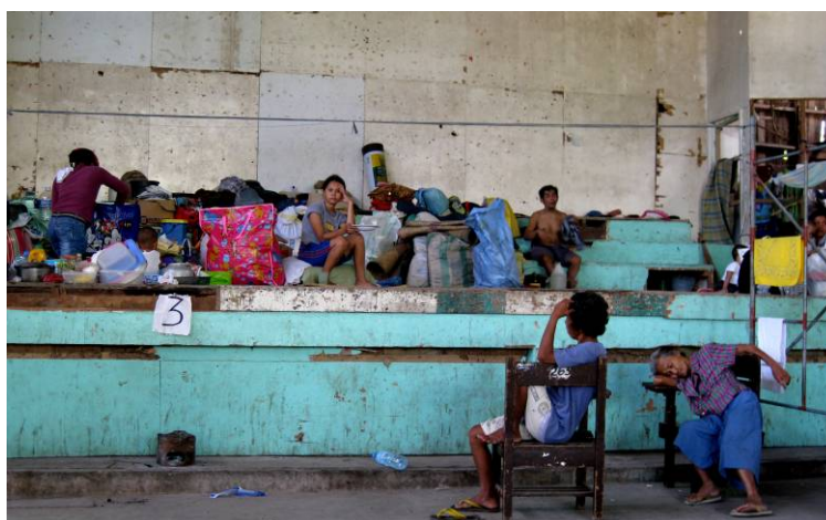
Figure 10: At daytime in many IDP centres, only elderly, women, children are found

In most of the sites visited by Amnesty International, there were midwives and at least one social worker present. Medical care, however, was inadequate. There were reports of children dying from diarrhoea in some centres. While on one centre visited by Amnesty International there was a debriefing session conducted by the social workers, other displaced people, especially those staying with relatives, do not receive professional help in processing their often traumatic experiences.