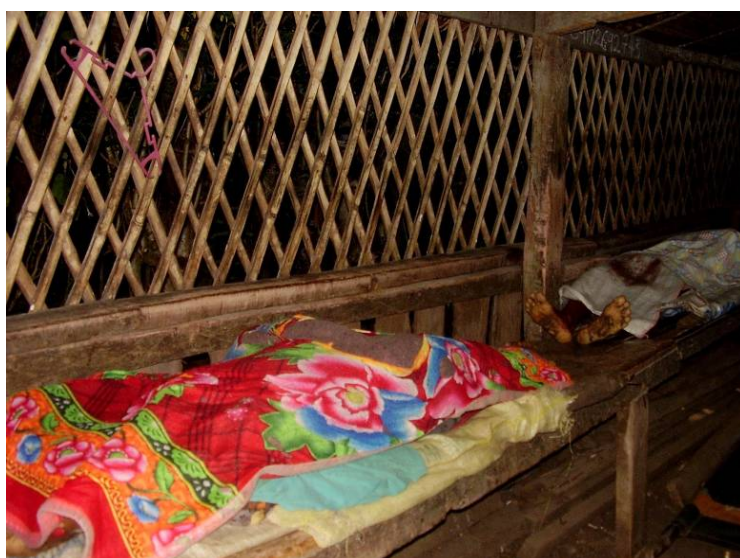
Figure 15: Volunteers recovering the body of Dulcisimo