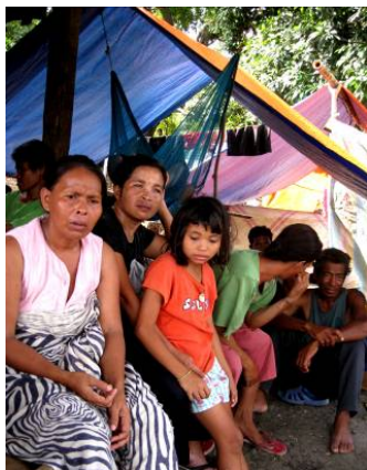
Figure 14: internally displaced persons in North Cotabato province

government to adhere to the UN Guiding Principles for Internal Displacement, including Principle 3(1) which states: “National authorities have the primary duty and responsibility to provide protection and humanitarian assistance to internally displaced persons” and Principle 24 (2) “Humanitarian assistance to internally displaced persons shall not be diverted, in particular for political or military reasons.”