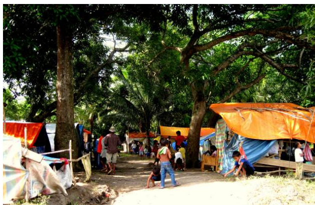
Figure 12: Fatima’s “new home” is one of these tents

“We did not really want to come to Pikit because we had our farm to think about and our crops were ready for harvest. When the military came, we were asked to leave our village. My husband asked for the military’s permission to go back to our farms just to harvest our crops, but they said no. They had to ‘clear’ the area of MILF fighters. Then, that same day, the fighting began and we had to flee to Pikit Poblacion (town centre). Nowadays we just sit here, waiting. Waiting for dole outs from NGOs. Waiting to receive rice, noodles, sardines. We wait for handouts, but our farms are also waiting for us. The copra in our backyard is waiting. The corn, ready to be harvested is also waiting. They wait, we wait. Look at our new home. When it rains, the water seeps in. Last week, my husband had fever. Now, he’s better. He wants to go back and try to harvest our crops so that we do not have to rely on handouts.”