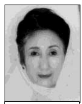
Rebiya Kadeer

despite repeated calls for their release from other governments, human rights mechanisms of the United Nations, and non-governmental organizations, including Amnesty International.