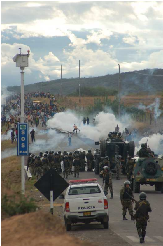
DINOES police officers using tear gas against protestors on the road towards Bagua, 5 June 2009.