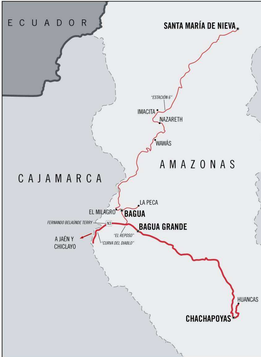
Approximate distances: Bagua – Imacita: 80km; Bagua – Chachapoyas: 100km; Bagua – El Milagro: 5km; Bagua – Chiclayo: 300km. The thin red line indicates a road that includes non-surfaced stretches.