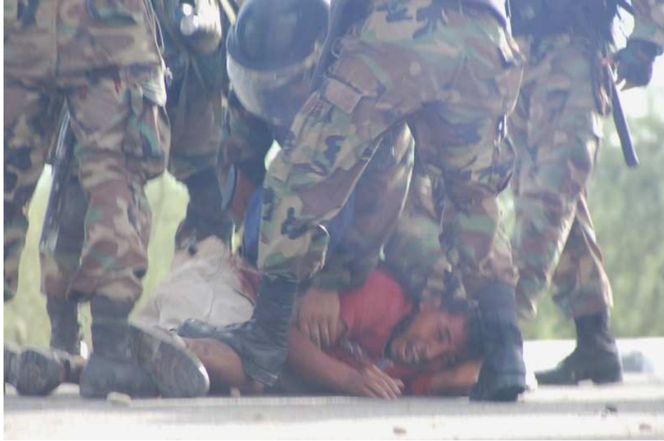
Police beating a protestor on the road towards Bagua, 5 June 2009.

In the towns of Bagua and Bagua Grande, where injured protestors were being taken and townspeople gathered, some of them to help the injured, others to protest against the operation at the Curva del Diablo , police officers also appear to have been responsible for an indiscriminate and disproportionate use of firearms against defenceless civilians, including children. 21 [See interview with the parents of Abel Ticlla Sánchez on pp. 38-40].