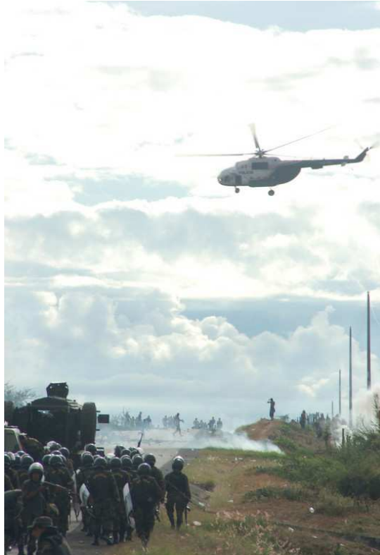
Police helicopter flying over the police operation on the road to Bagua, 5 June 2009.

and act in proportion to the seriousness of the offence and the legitimate objective to be achieved" and "[m]inimize damage and injury". 22 Due to its ability to cause pain, discomfort, illness and possible death the deployment of non-lethal incapacitating weapons, such as tear gas, should be carefully evaluated in order to minimize the risk of endangering uninvolved