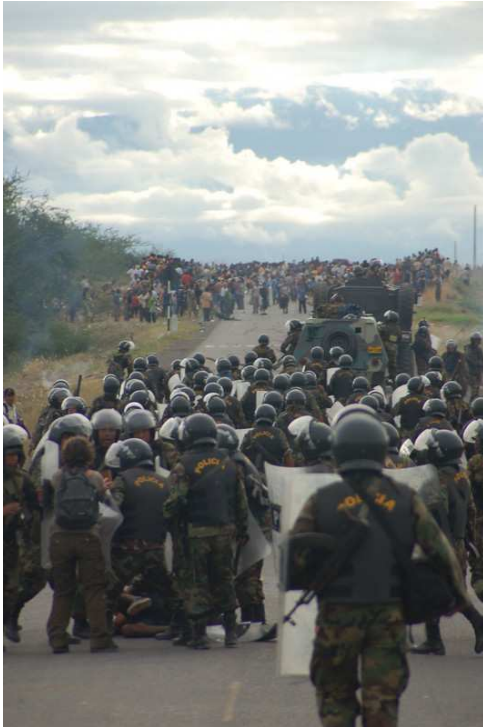
Police beating a protestor on the road to Bagua, 5 June 2009.

in the UN Code of Conduct for Law Enforcement Officials and in the UN Basic Principles on the Use of Force and Firearms by Law Enforcement Officials. 20 Force must be used in a manner that minimizes risks of injury and death and in all cases, use of firearms is only permitted to protect against an imminent threat of death or serious injury.