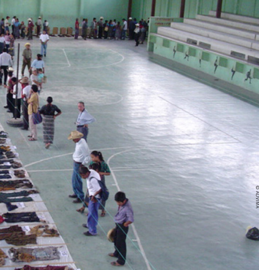
Clockwise from top: Identification of the clothing of 74 massacre victims exhumed from the former military base at Rabinal, Baja Verapaz, July 2008.