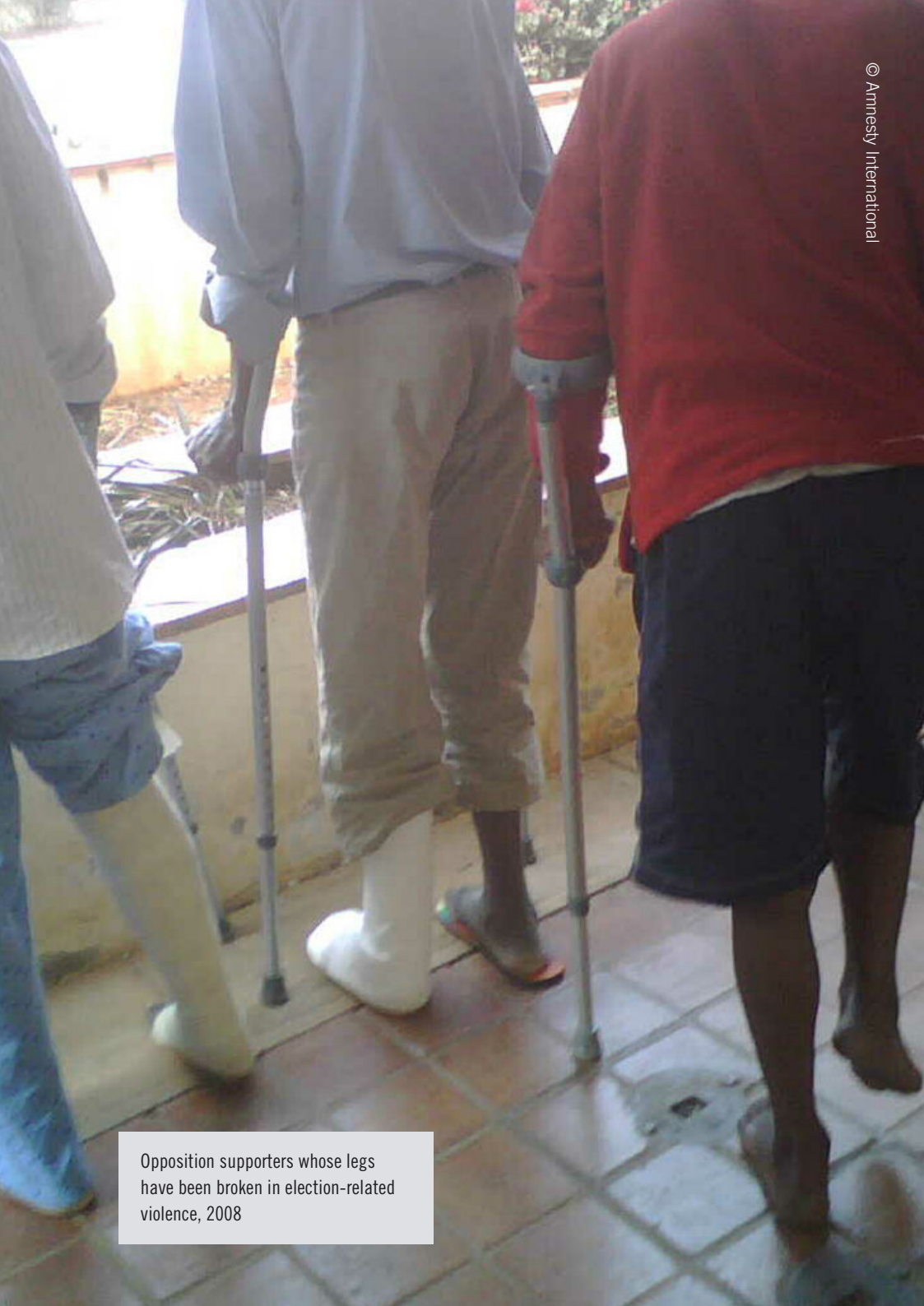
Opposition supporters whose legs have been broken in election-related violence, 2008