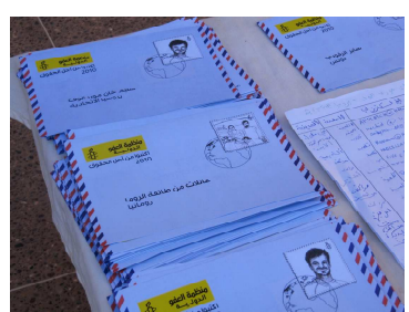
2010 Letter Writing Marathon Materials at an Al Morocco event