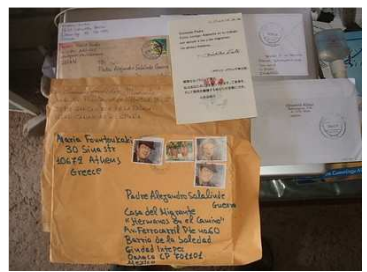
Letters received by Father Solalinde following the 2010 Letter Writing Marathon