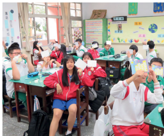
Students and school teachers in Taiwan organized letter writing events with Amnesty International for the Write for Rights campaign 2019.

If you are not familiar with participatory learning methods, look at Amnesty International's Facilitation Manual before you start. This can be found at www.amnesty.org/en/documents/ACT35/020/2011/en/