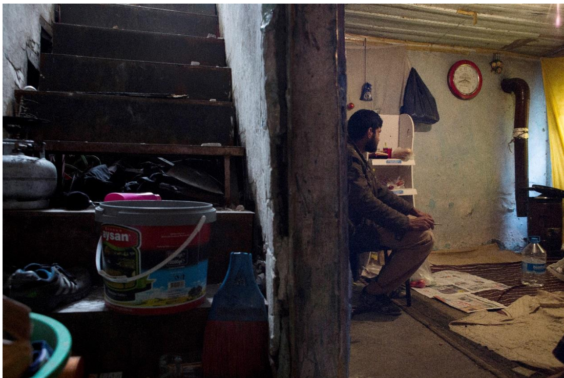
An Afghan asylum-seeker living in Istanbul. Afghans have no realistic prospect of either being integrated in Turkey or resettled to another country.

This chapter discusses the second requirement for the return of asylum-seekers and refugees to Turkey under the EU-Turkey Deal, namely that people are able to access what are known as “durable solutions.” UNHCR has identified three possible ways in which this obligation can be met: repatriation (when safe to do so) to countries of origin, integration in host countries, and resettlement to third countries. In the absence, to date at least, of a large scale resettlement programme from Turkey, and with little prospect of safe return for Syrians, and indeed many other refugees, the question of the long-term status and attendant rights of persons in need of international protection becomes particularly important. Turkey’s ability to provide durable solutions to refugees is severely compromised, however, by the continuing denial of full refugee status to non-Europeans.