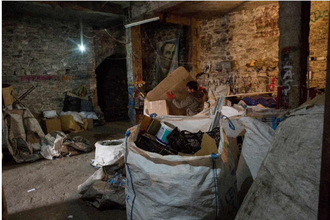
Many Afghan asylum-seekers support themselves in Istanbul by selling recyclable materials they collect from garbage bins, which is later weighed and sorted in depots such as this operation.

Children needing to work to meet the basic needs of their families is a widespread problem, despite this being contrary to Turkey's domestic and international legal obligations. 131 UN agencies report that among Syrian refugees in the country, "child labour is a common phenomenon." 132 In a 2015 survey of over 700 Syrian refugees in Istanbul, the most common reasons for children's non-enrolment in school were that the children needed to work to support the family (26.6%) and that the family could not afford the school fees (20.3%). 133 A Syrian mother of three boys, living in Gaziantep, told Amnesty International that the shrapnel injuries her husband sustained in Syria prevent him from working, and that the entire family of seven survives on the 5-10 Turkish Lira per day (about 1.75 to 3.50 USD) that her nine-year old son earns working at a grocery store. 134 An Iraqi man from Dohuk, living in Istanbul, said that his three children – a daughter aged 18 and two sons aged 17 and 16 – cannot attend school but must work instead. He said: "They must work; otherwise we cannot survive." The 18-year old daughter told Amnesty International that she and her brothers work in a textile factory five days a week, from 8 a.m. until 7:30 p.m., and each make 250 Turkish Lira (about 88 USD) per week. The father said that he was unable to find a job that did not require very long hours, which he is unable to do because he says he is old and tires easily. 135