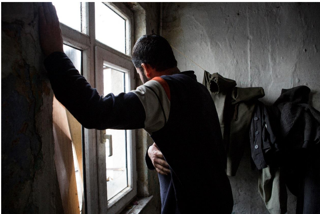
An Afghan asylum-seeker looking out from his flat in Istanbul.

EU member states should be looking at activating such a scheme, in meaningful numbers, without delay.