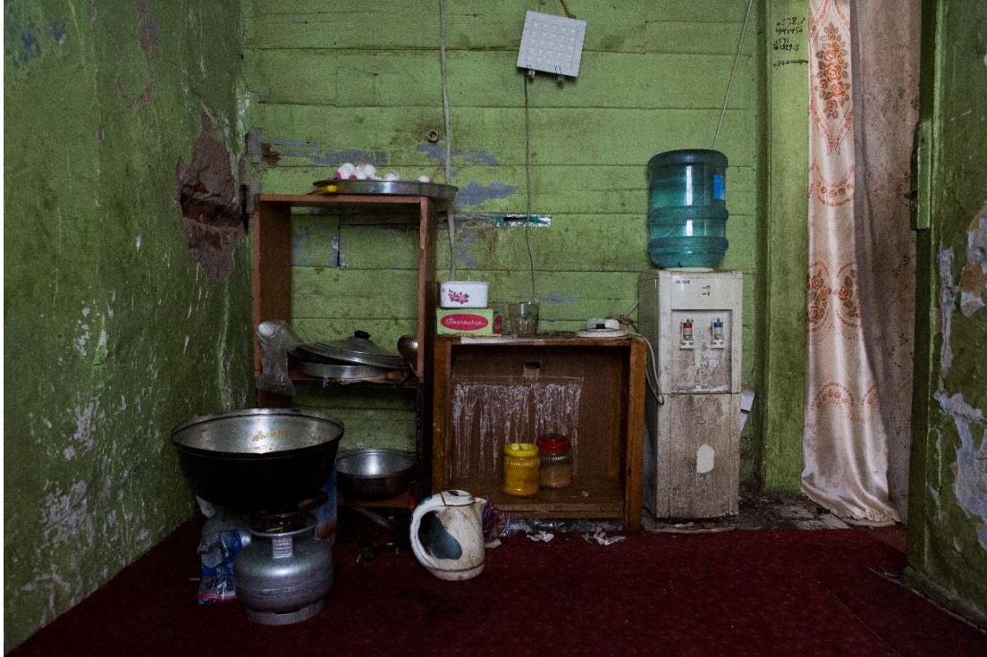
The kitchen for 15 Afghan and Pakistani asylum-seekers living in Istanbul.

living in one small and partly underground room; two single beds, a table, and a refrigerator occupied virtually the entire space. 96