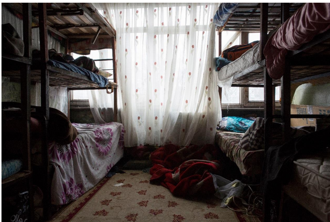
About 12 asylum-seekers from Afghanistan live in this room in Istanbul, below which is an industrial operation where the recyclable materials that they collect from the garbage are weighed and sorted.

This chapter assesses whether Turkey meets the third criterion for effective protection: access to means of subsistence sufficient to maintain an adequate standard of living. With state authorities unable to meet people’s basic needs – in particular shelter – combined with the significant barriers that people experience in achieving self-reliance, the reality is that Turkey is failing to provide an environment where asylum-seekers and refugees can be guaranteed the ability to live in dignity.