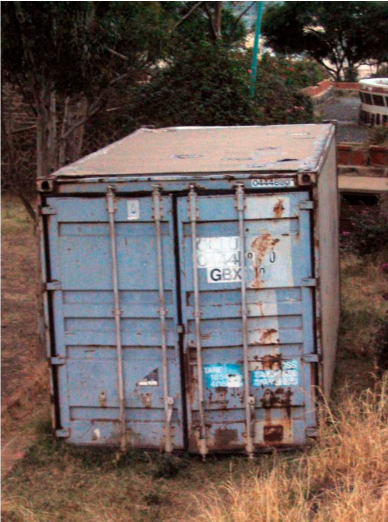
An example of a shipping container used by the Eritrean government for detention

©Private | FILE photo used in Eritrea 'You have no risk to ask- Government resists scrutiny of Human rights.' (2004)