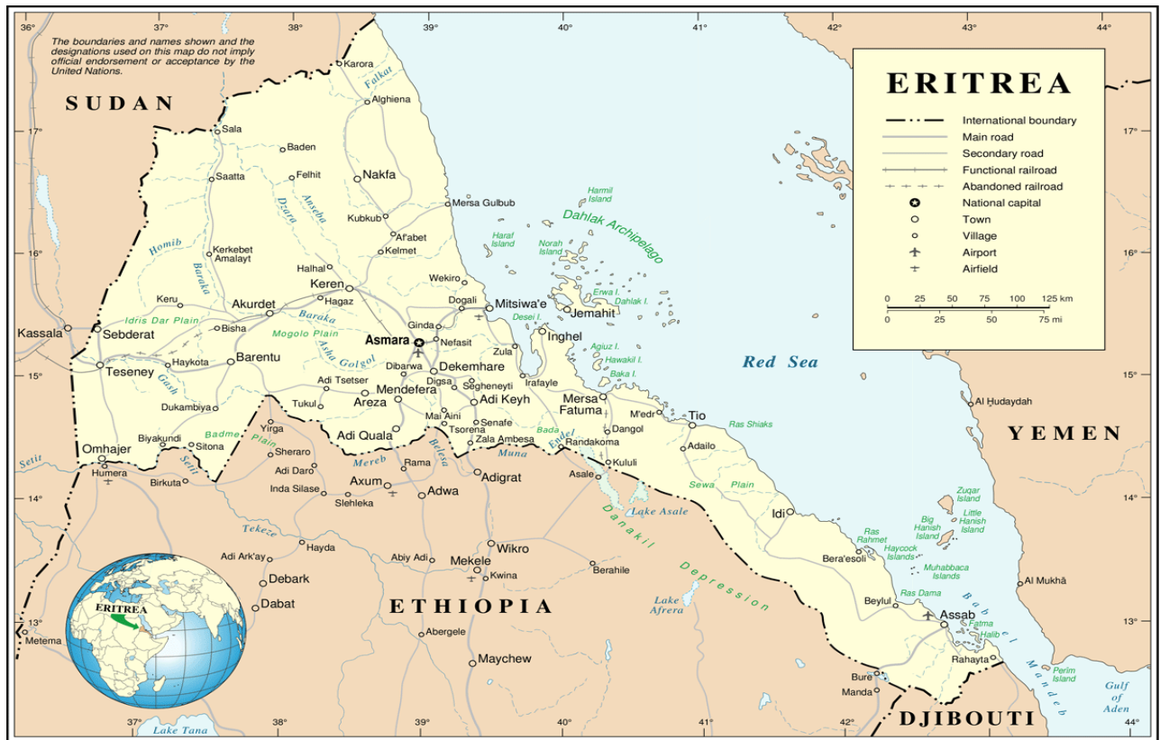
Map of Eritrea.