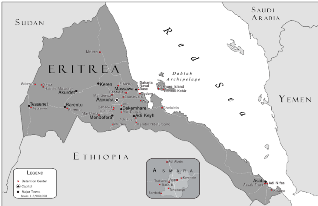
Suspected Detention Centers in Eritrea

Suspected detention centres in Eritrea, 2013 ©Amnesty International FILE photo used in Eritrea: 20 years of independence, but still no freedom (2013).