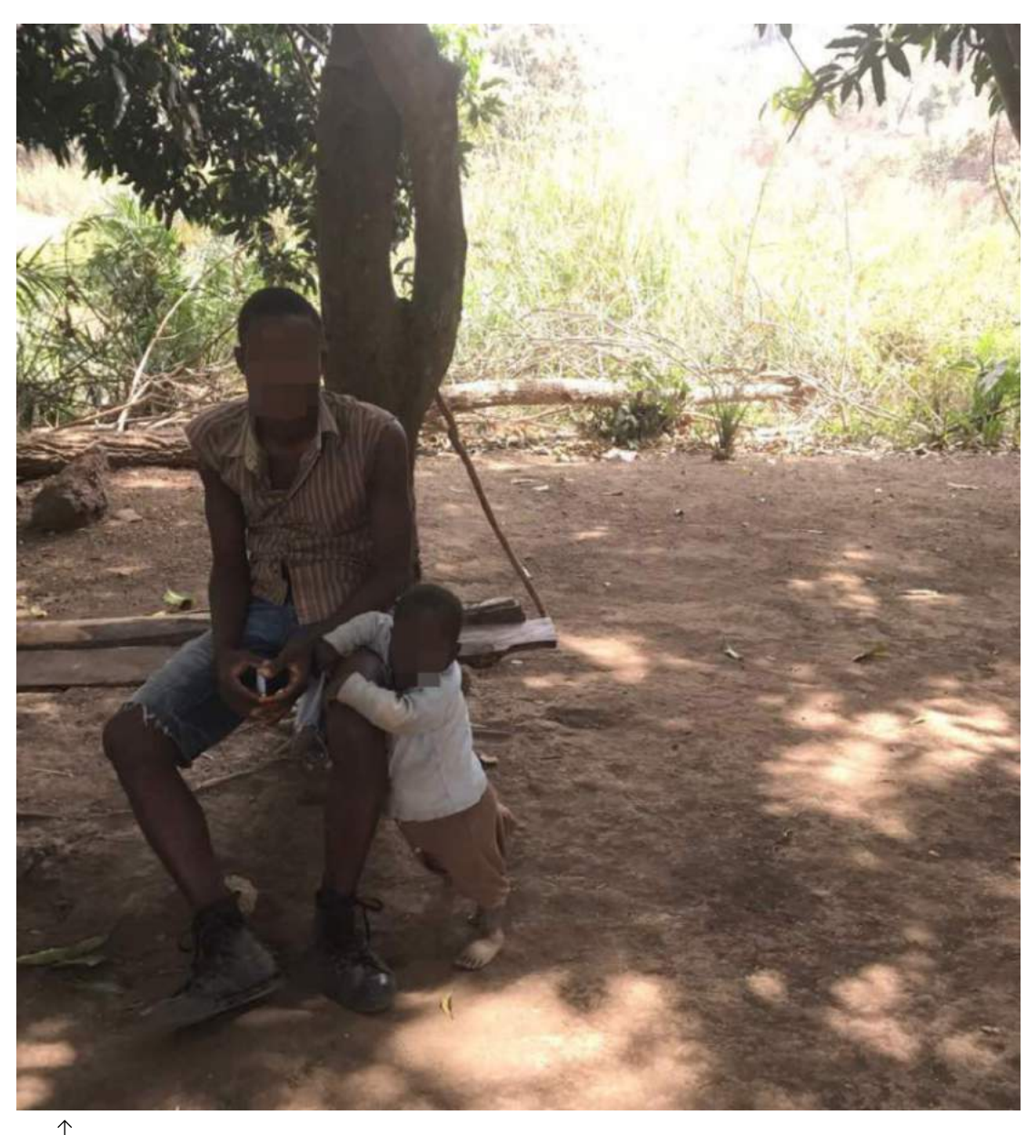
Photo of man shot and injured during Kabala youth protest in 2016.

In addition, one of the four men<sup>157</sup> who sustained gunshot wounds also told Amnesty International that he has yet to receive adequate redress. He was shot in the back while he was walking in the town, as the crowd was dispersing. A police officer told people to take him to the hospital following his injury. He was first seen by a Medecins Sans Frontiers<sup>158</sup> doctor, who referred him to Connaught Hospital in Freetown for further treatment. He was then referred to Bo (Southern Province) for physiotherapy treatment. MSF covered part of his medical costs and he has received some assistance from the Chief and other community members in Kabala, including a wheelchair. "I used to do construction work," he told Amnesty International. "Now I can't do anything." He and his family struggle to provide for themselves financially and have moved outside of Kabala as it is cheaper. He did not receive any formal compensation from the government.<sup>159</sup>