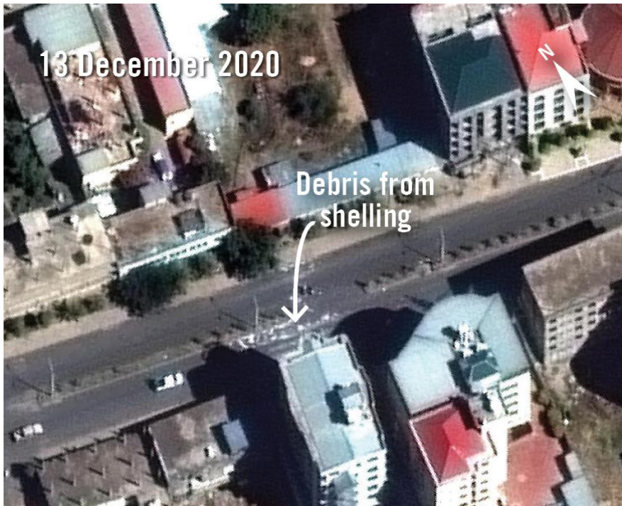
Debris from shelling is visible in front of the Brana Hotel, on Axum's old main road, in this satellite imagery from 13 December 2020. A man who had fled and who came back to the city around 25-26 November said: "After I came back to the city, I ... saw the Brana Hotel ... really damaged."