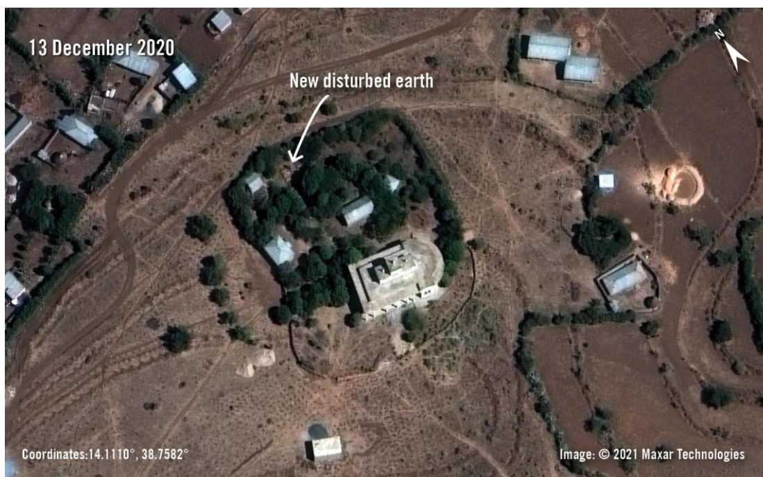
The Abune Aregawi church, located in the Semeret neighbourhood on the southeastern edge of Axum, shows new disturbed earth in satellite imagery from 13 December 2020. While in some churches the victims of the massacre were buried in vaults, witnesses say that in Abune Aregawi, the graves were dug in soil.