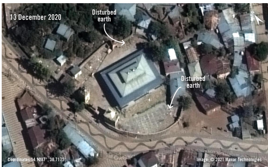
Satellite imagery taken on 13 December 2020 shows new disturbed earth at the Arba'etu Ensessa church in downtown Axum. It was here that, in the aftermath of the massacre, the largest funerals took place.

Two witnesses who spoke to the church authorities at Axum Tsion St Mary church (which encompasses Maryam Zion church proper as well as Arba'etu Ensessa) said 450 identified people were buried in that church alone. The figure excludes people who were buried there but not identified; the dead who were buried in other churches; and those who were buried on the roadside.