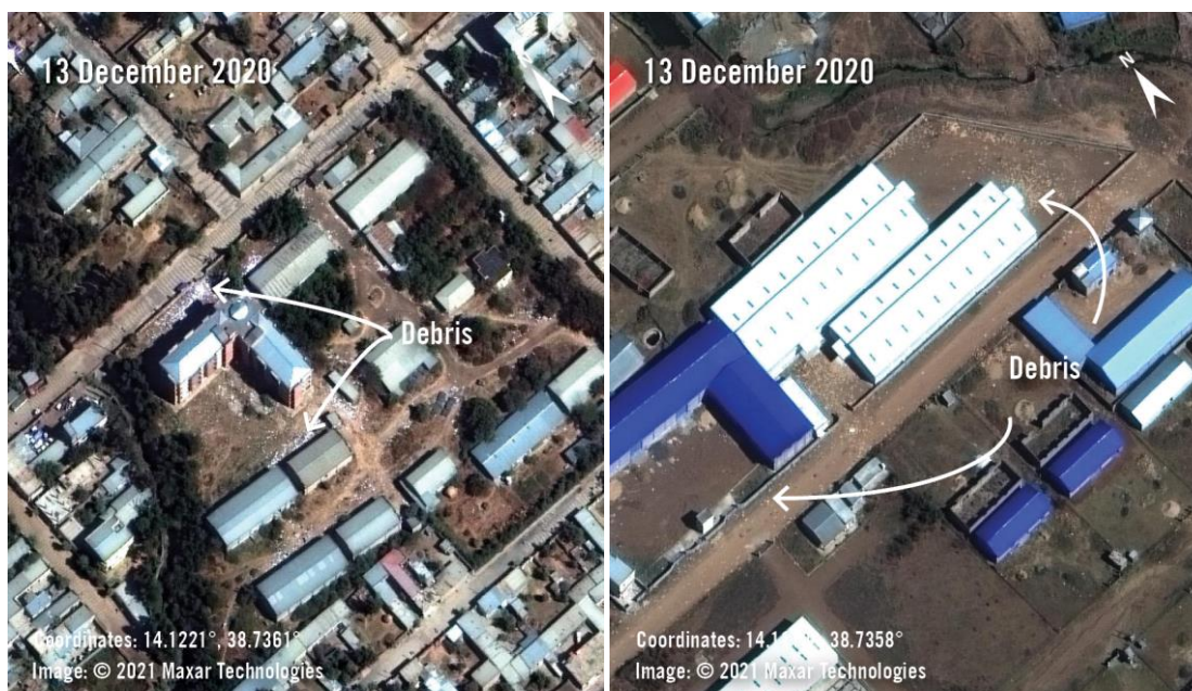
Debris consistent with looting around an unidentified building in central Axum, shown on satellite imagery from 13 December 2020. According to residents, Eritrean soldiers looted the university, private houses, hotels, hospitals, grain storage facilities, petrol stations, banks, electrical and maintenance stores, supermarkets, bakeries, jewelries, vendors' shacks (known locally as "containers"), and other shops, breaking through entrance doors with automatic weapons.