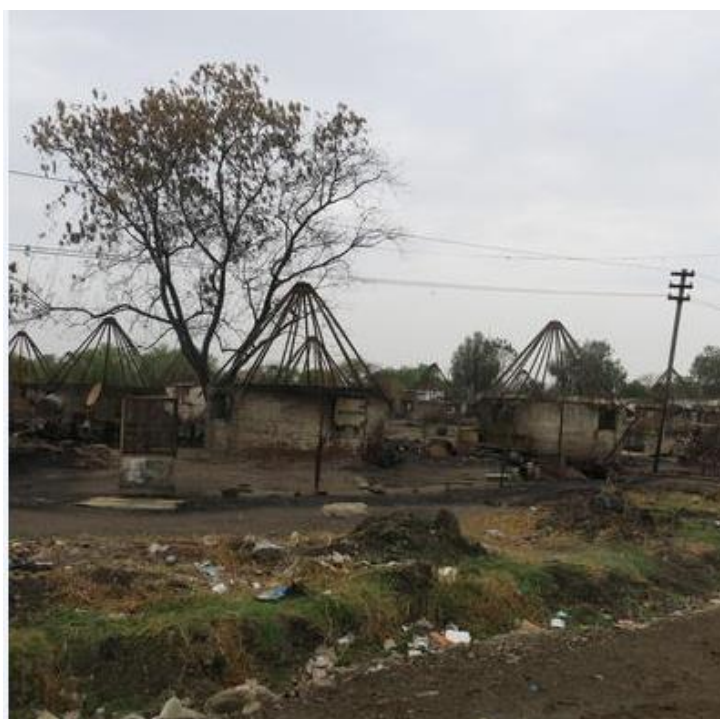
Burned down homes in Malakal

When Amnesty International visited the town from 10 to 14 March, it was under the control of opposition forces. Much of the town lay in ruins, with homes and other property looted and burned down. The entire civilian population had fled, with only a few individuals connected to opposition fighters remaining in town. Some 21,000 people, mostly Shilluk and Dinka and a smaller number of Nuer, were sheltering in the protection site of the UNMISS base at the edge of town. The rest had fled to surrounding rural areas and farther afield. Large numbers of Nuer had reportedly gone to the opposition stronghold of Nasir to the south-east.