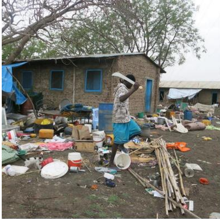
Compound of Christ The King Church in Malakal