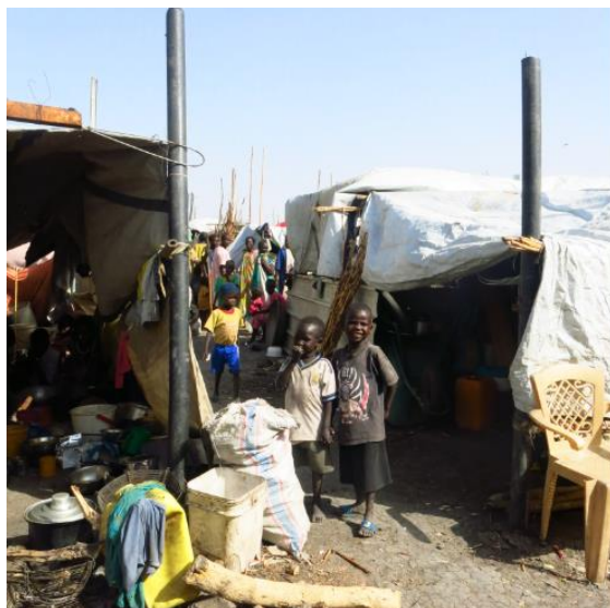
Malakal IDP camp where thousands live in dire conditions, March 2014.

UNMISS peacekeepers are currently conducting patrols around the immediate vicinity of the protection sites. They should increase patrols and extend them farther to both to better ensure the safety of those within the protection sites and as well as to improve security for those who wish to venture outside, or leave. The Mission should provide escorts to those who need to move beyond the perimeter of the protection site for essential purposes. According to UNMISS, the delays in the arrival of troops have so far constrained the Mission's ability to extend patrols. 79