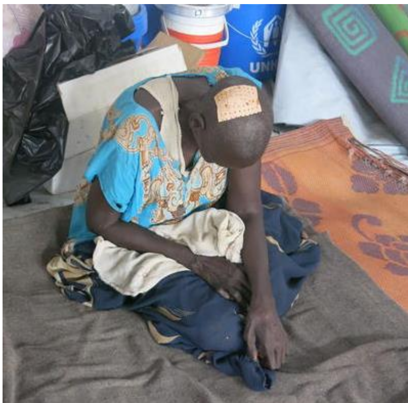
This blind elderly Shilluk woman was beaten by opposition fighters in Malakal hospital in February 2014.