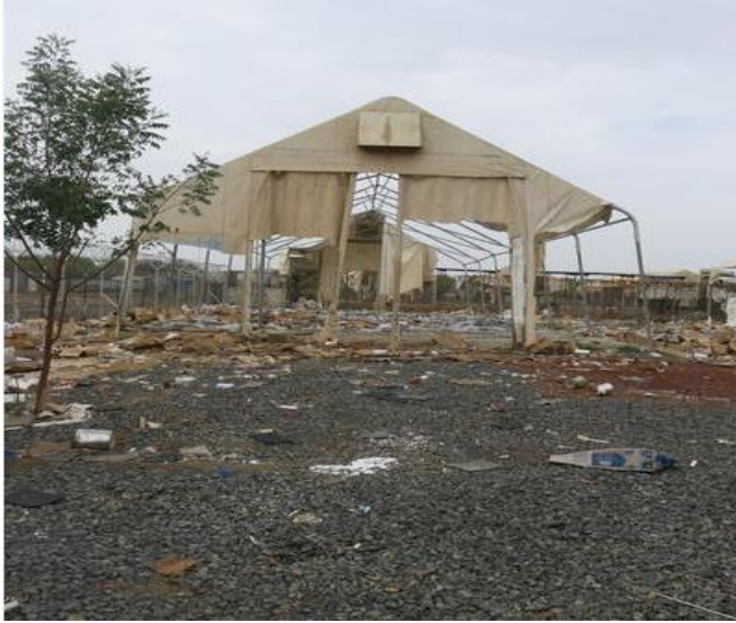
WFP food store in Malakal looted and trashed; the looting and destruction has worsened an already severe food crisis.

World Food Programme (WFP) warehouses in Malakal were completely looted and destroyed in January, when opposition forces gained control of the town. Civilians participated in the looting, accelerating the speed and scale at which properties were taken. Food supplies sufficient to feed 400,000 people for three months were reportedly looted in less than three days. In the surrounding areas, Amnesty International delegates saw scattered empty tins of oil—all that remained.