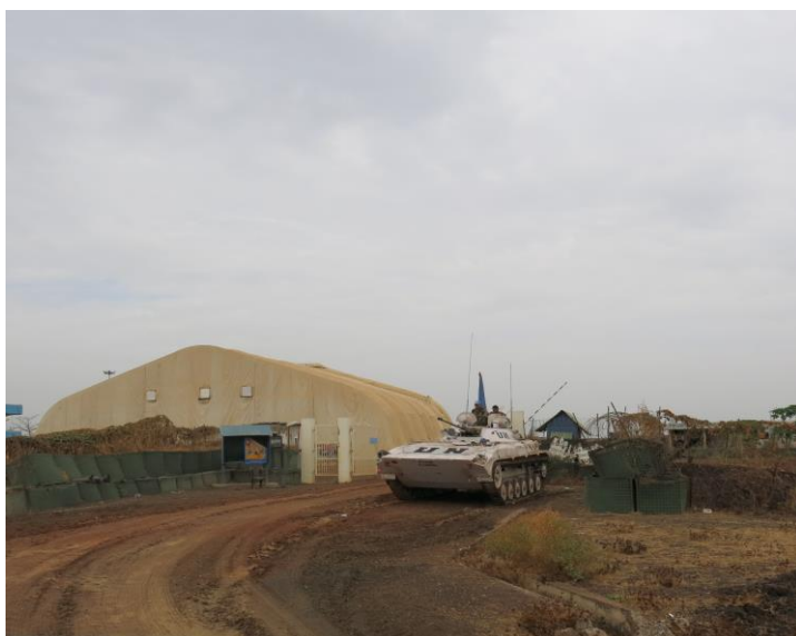
UNMISS armoured vehicle at the base where residents displaced by the conflict are sheltering in Malakal

UNMISS is providing sanctuary for some 80,000, of the 950,000 who are currently internally displaced by the conflict. 74 They are sheltering in the protection sites of eight UNMISS compounds across the country, and many of them are too afraid to venture beyond the gates. In offering sanctuary and providing protection for these individuals, the Mission has undoubtedly saved many lives. Yet it has found itself in an unprecedented situation and in a role for which it was not prepared. The Mission had envisaged perhaps being called upon to provide a temporary safe-haven during intense conflict, after which civilians would return to their homes. But now, several months into the conflict, civilians have not left and more continue to seek refuge in UNMISS protection sites that are not designed to host such large numbers of people over long periods of time. There are, in addition, serious security concerns. Civilians and armed actors seem oblivious to the protections accorded under international humanitarian law to places of sanctuary, to UN peacekeepers, and to peacekeeping bases.