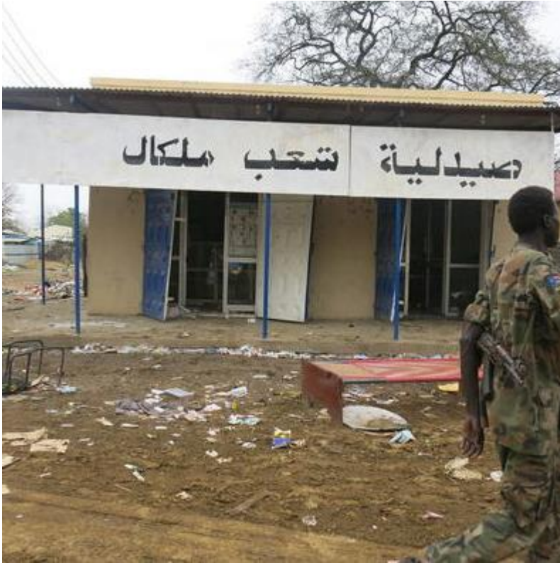
Armed opposition fighters outside Malakal Hospital

Amnesty International delegates visited the hospital on 12 March, most of the bodies had been removed, but at least three human skeletons remained.