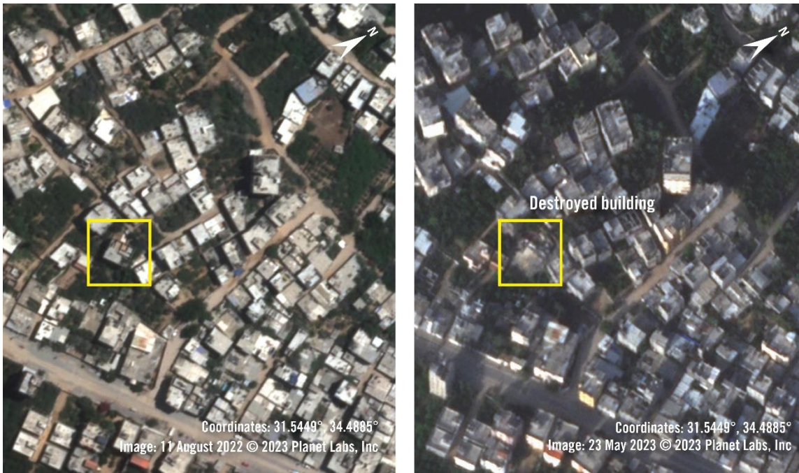
Jabalia Refugee Camp, Gaza: Satellite imagery above shows a building in Jabalia Refugee Camp area on 11 August 2022 (left). On 23 May 2023 (right), imagery shows the building appears flattened with debris surrounding the area.

At around 6.30pm on 13 May, an Israeli fighter jet dropped what appears to have been a GBU-32/31 bomb on a four-storey building of eight apartments belonging to the Nabhan family in Jabalia refugee camp in the northern Gaza Strip. The building was home to 42 people, five of them living with disabilities, including three wheelchair users. The residents were given only 15 minutes warning before the attack. This gave them insufficient time to carry out electric wheelchairs, which were then destroyed in the air strike.