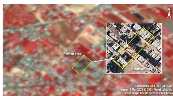
Deir al-Balah, central Gaza: False colour near-infrared imagery shown in the left photo highlights healthy vegetation in red hues and burned vegetation in darker black hues. On 12 May at 07:33 UTC, the area within the yellow square appears to have healthy vegetation present. On 13 May at 08:02 UTC, the vegetation appears burned where the bomb was reported to have struck as shown in the photo to the right. Historical imagery is shown to highlight the areas that appear burned in the satellite imagery.

After examining photographs of the ammunition remnants taken by a fieldworker contracted by Amnesty International, as well as open-source footage of the aftermath of the strike, Amnesty International's weapons expert found no evidence that the neighbourhood had been used by any Palestinian armed group to store or manufacture weapons. There were no secondary explosions or conflagrations in the neighbourhood that would have likely resulted from stored weapons, nor was there any indication that rockets had been manufactured or fired from the targeted site or its immediate vicinity. It is also extremely unlikely that armed groups had used the targeted house to store sensitive electronic devices or command cyber operations that could in any way contribute to military operations.