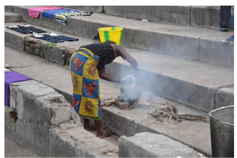
A woman prepares a meal on the terraces of Cardinal Malula Stadium in Kinshasa where many arriving from Brazzaville were initially sheltered.