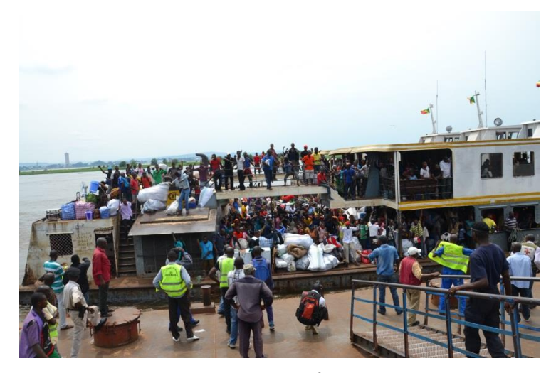
During operation Mbata Ya Bakolo, thousands of DR Congo nationals arrived back in the country every day. While some were able to return with their personal effects, this was not the case for all.

In the case of the Republic of Congo, the human rights violations and abuses committed in the framework of operation Mbata ya Bakolo and outlined in this report caused many DRC nationals to leave the country. Their returns constitute disquised expulsions, in violation of several international law obligations to which the Republic of Congo is bound, including: Article 33 of the 1951 Convention relating to the Status of Refugees; Article 3 of the UN Convention Against Torture; Article 13 of the International Covenant on Civil and Political Rights; Article 2.3 and 5.1 of the African Union Convention Governing the Specific Aspects of Refugee Problems in Africa; Articles 7 and 12 of the African Charter on Human and Peoples' Rights (see below).