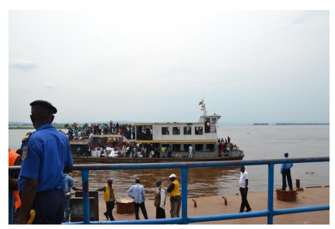
Boats ferried DR Congo nationals expelled from the Republic of Congo. During the peak days of the operation, 7,000 to 8,000 people arrived in Kinshasa daily.