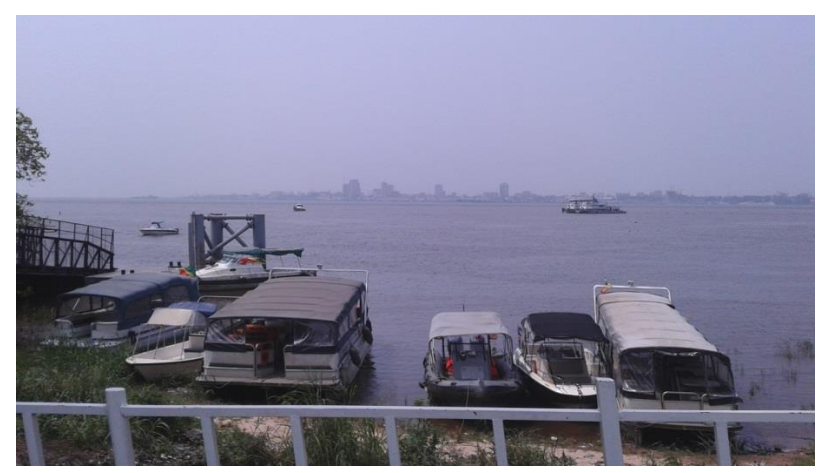
View of Kinshasa from the port of Brazzaville.

Although expulsions are not mentioned as a main line of action in the concept note describing the operation, Amnesty International's research demonstrates that the core of operation Mbata ya Bakolo consisted of mass expulsions of DRC nationals, mostly irrespective of their migration status. According to the government of the Republic of Congo, 158,724 families, that is about 245,000 DRC nationals, returned "voluntarily" to DRC during the operation.<sup>25</sup> According to the DRC government, operation Mbata ya Bakolo resulted in the deportation of at least 179,452 nationals of the Democratic Republic of Congo (DRC).<sup>26</sup> Over 40% of those registered in the DRC (73,614) were minors. At least 60 of them were refugees or asylum-seekers.<sup>27</sup> A number were migrants who were lawfully residing in the country.<sup>28</sup>