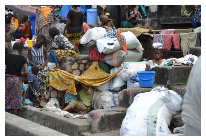
Many of those arriving in Kinshasa were initially sheltered at Cardinal Malula Stadium. Here, a woman uses a piece of fabric as a makeshift shelter.