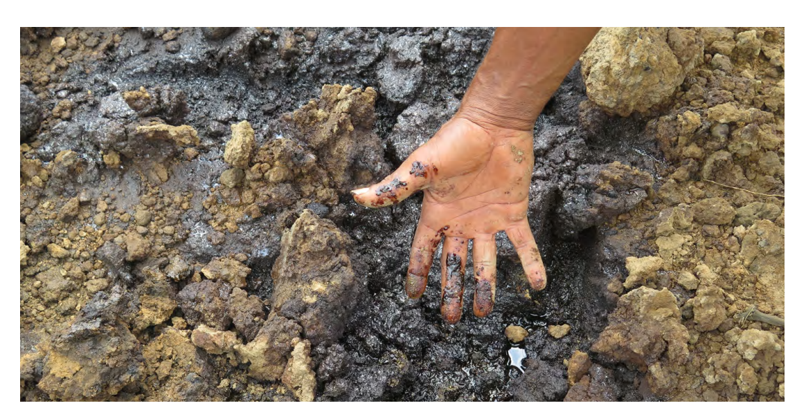
In 2015, contaminated land surrounds the Bomu Manifold, a Shell facility at Kegbara Dere (K.Dere), Rivers State, Nigeria, years after spills occurred.

Based on an analysis of research conducted over many years by Amnesty International, other civil society groups, and UNEP, any due diligence should consider the following questions. This is a non-exhaustive list.