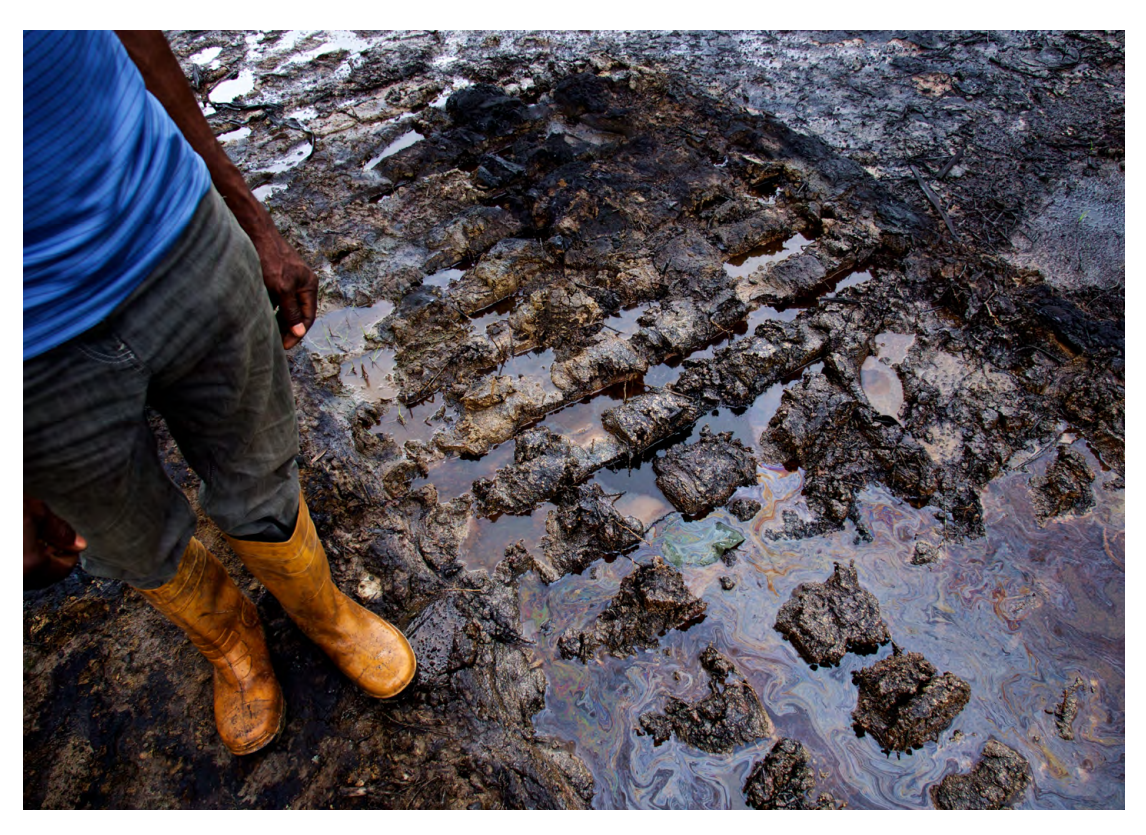
Unremediated oil spill at Kegbara-Dere (K-Dere) community in Rivers State, Niger Delta, Nigeria, 2015.

Shell has been reporting oil spill statistics annually since 1995 and was the first oil company operating in Nigeria to start publishing its JIV reports on a dedicated website in 2011. Shell has taken recent steps to improve its reporting by adding videos. However, Shell, like others, does not publish reports relating to oil spill remediation, making it difficult for communities to assess how effective that action is, or the extent to which their soil and water remains contaminated after clean up.