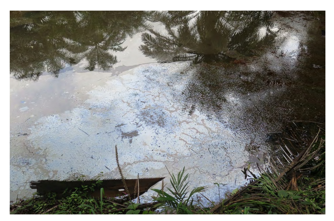
A contaminated fish pond in Kegbara-Dere (K-Dere) community in Rivers State, Niger Delta, Nigeria, 2015.

The main adverse impacts of oil exploitation in the Niger Delta, as documented by Amnesty International and its partner, the Port Harcourt-based, Centre for the Environment, Human Rights and Development (CEHRD), include violations and abuses of the following human rights:<sup>15</sup>