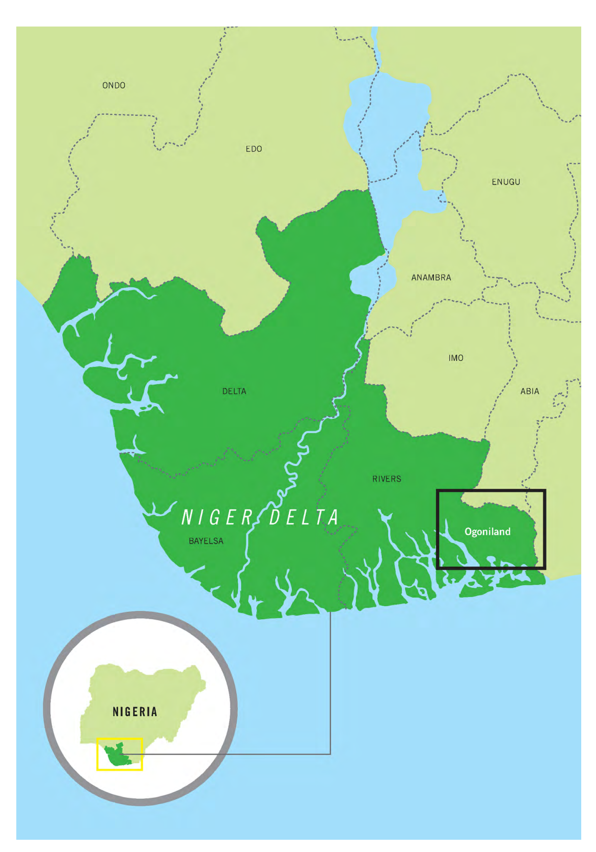
Map of the Niger Delta region in Nigeria.