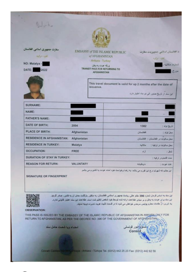
Travel document from the Afghan embassy in Turkey.

In two cases, Turkish authorities pressured interviewees to sign by telling them that they will be detained longer, and in the end deported, if they did not sign, according to testimonies.<sup>219</sup>