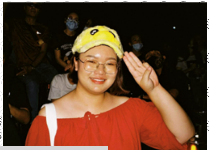
Top to bottom: Images of Rung attending demonstrations in Thailand