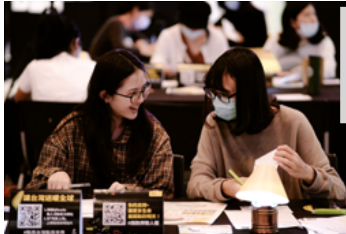
Amnesty International Taiwan letter writing event, December 2020.

Alongside the letter writing actions, Amnesty also speaks to those who have the power to change these people's situations, such as politicians in their