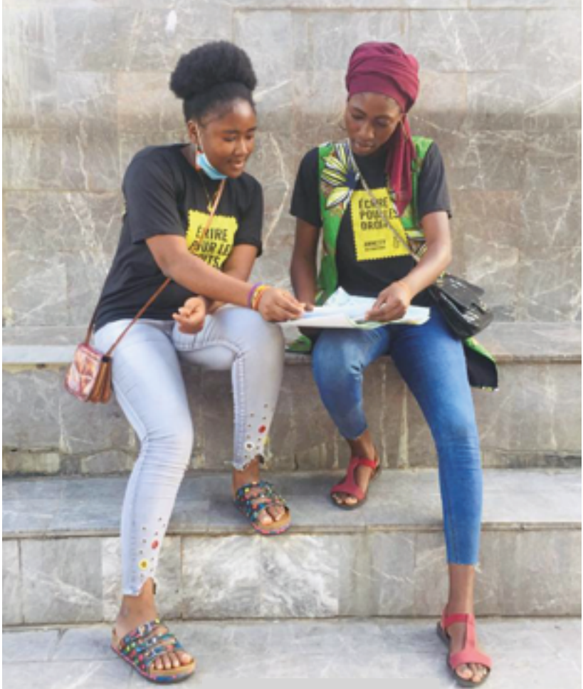
Amnesty International Benin letter writing event, December 2020.

Human rights are not luxuries to be met only when practicalities allow.