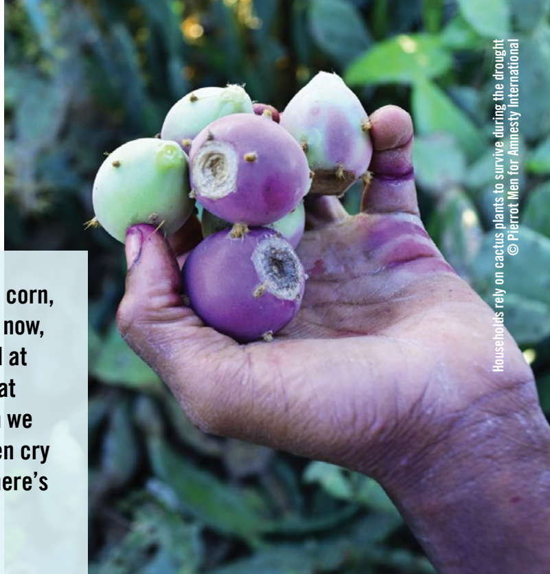
Households rely on cactus plants to survive during the drought

'We used to eat three times a day. We would eat corn, sorghum, sweet potatoes, and manioc, but right now, you can hardly find anything. In the morning and at lunchtime, we either don't eat anything, or we eat young cactuses. We remove the thorns and then we boil them, and we give that to the children. I even cry when I watch the children eat sometimes, but there's nothing more I can do.' 11