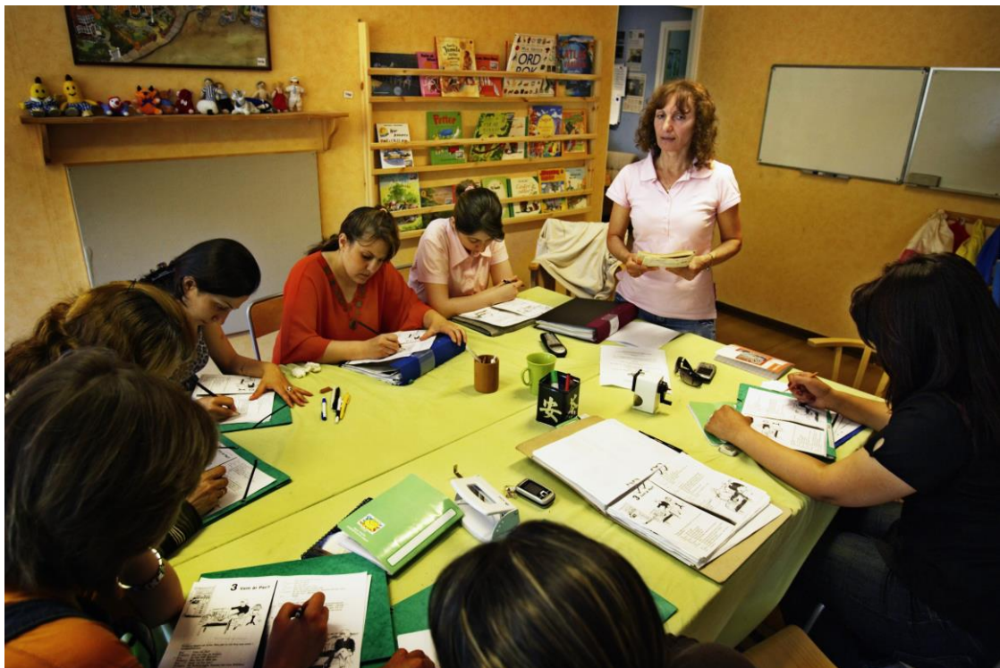
Iraqi refugees learn Swedish at a school in Södertälje, Sweden, © Panos Pictures, June 2006

As highlighted above, Amnesty International currently opposes all forcible returns to any part of Iraq. As such, in order to avoid a situation whereby individuals that reach the end of the asylum process become destitute and as such may be compelled to leave the host country due to the inability to meet their basic daily needs such as shelter, food and healthcare, rejected Iraqi asylum seekers should receive financial support and accommodation if needed with the same entitlements and rights as provided during the asylum process; be given permission to work; full access to health care, all levels of education and right to claim benefits until their situation is resolved.