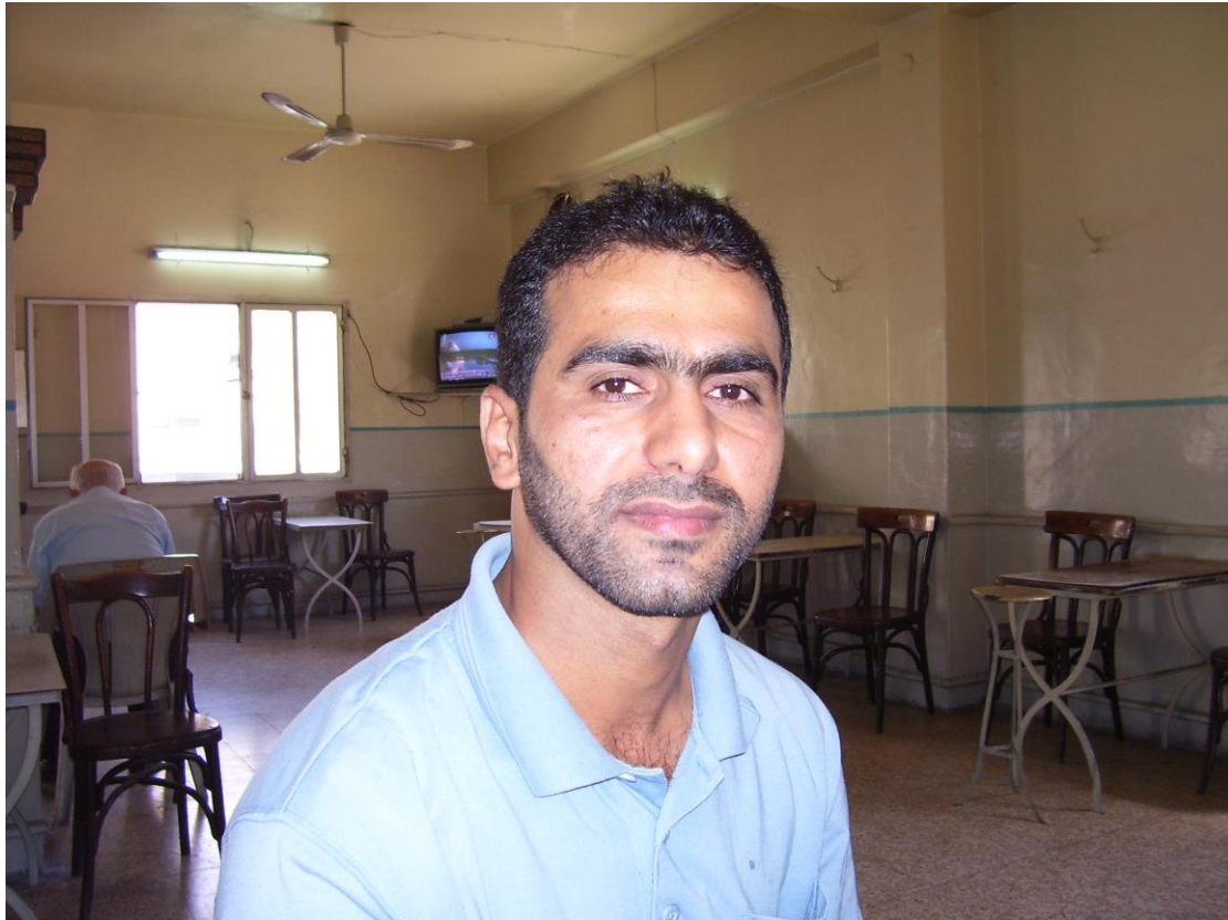
An Iraqi human rights defender from Basra, recognized by UNHCR as a refugee and awaiting resettlement from Jordan to Australia, © AI, Amman, September 2007

Australia has taken approximately 2,000 Iraqis a year over the past five years, and Amnesty International hopes the authorities will maintain this policy but increase its