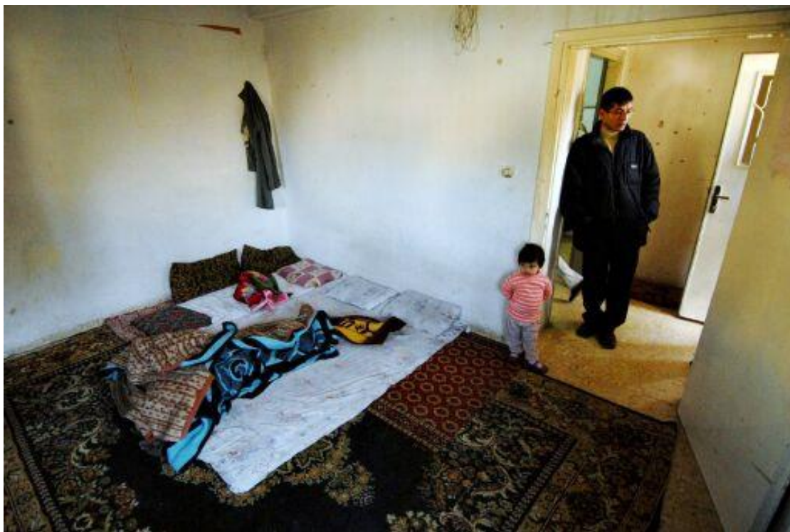
In Amman, most Iraqi refugees live in very basic and often crowded accommodation, © UNHRC/P.Sands, 12 September 2006

Amnesty International delegates were informed by a senior government official during their visit to Amman in September 2007 that the introduction of new visa restrictions, requiring that visas be issued before arrival at the border, was imminent. Such measures are aimed at clarifying the situation for many Iraqis who wish to leave Iraq and are currently selling their belongings to facilitate travel or taking real risks to reach the border, only to be turned away under the current approach to border entry operated by Jordanian officials. At present, only people with Jordanian residency, or certain categories of people such as those needing medical treatment certified by a hospital and those invited to attend seminars or conferences, are permitted entry. Amnesty International delegates were told by government officials that the intended