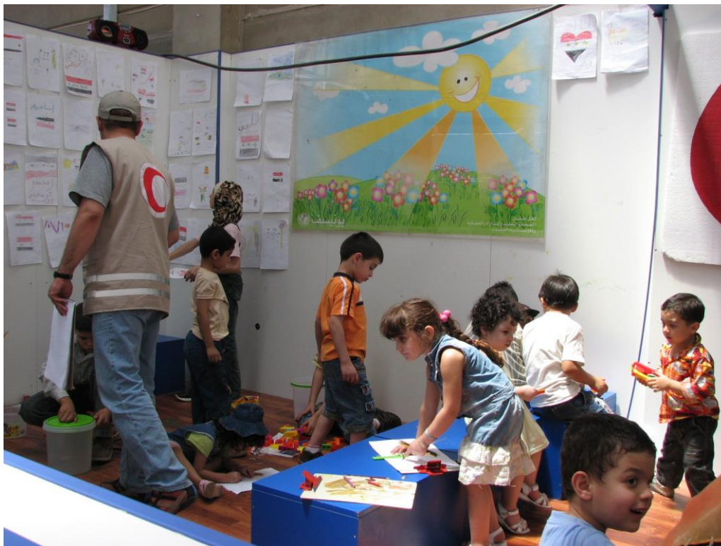
Iraqi refugee children being looked after by a volunteer of the Syrian Arab Red Crescent Society while their families are waiting to be registered with UNHCR in Damascus, Syria, © AI, June 2007

thirds of the 33,000 were attending schools in Greater Damascus. There are 5.3 million children attending schools in Syria nationwide.