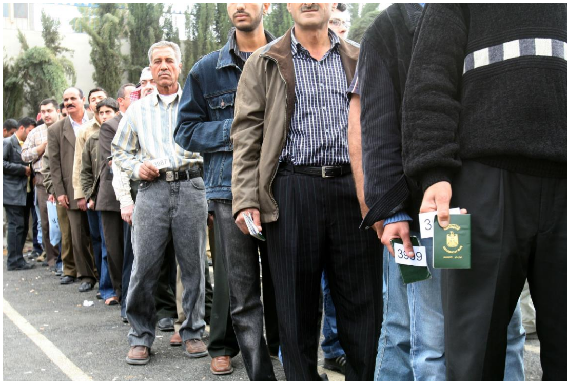
Iraqi refugees wait at a UNHCR office, near Damascus, Syria to register their names for residence, © Bassem Tellawi/AP/PA Photos, 23 April 2007

recent estimates suggest people are fleeing at faster rates than ever before. UNHCR recently predicted the number of newly displaced to be near 2,000 a day, equivalent to 80 an hour (day and night). 9