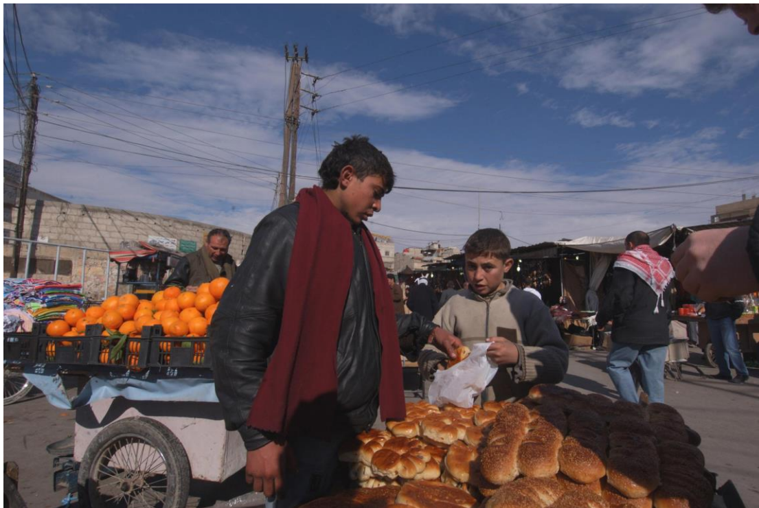
Iraqi refugees try to earn a living in the Sayida Zaynab market in Damascus

exception exists for certain professional categories, 14 the overall effect of this unwelcome measure will be a closed border for those needing to flee and obtain protection. Similarly, Amnesty International delegates were informed on their recent visit to the Jordanian capital Amman that the imposition of visa restrictions for Iraqis wishing to enter Jordan is imminent. If so, these new restrictions will further cut off Jordan as a safe haven. Earlier this year the Jordanian authorities introduced a severely restrictive border entry procedure whereby only those with residency permits or invitations for medical or educational purposes have been permitted to pass through the border.