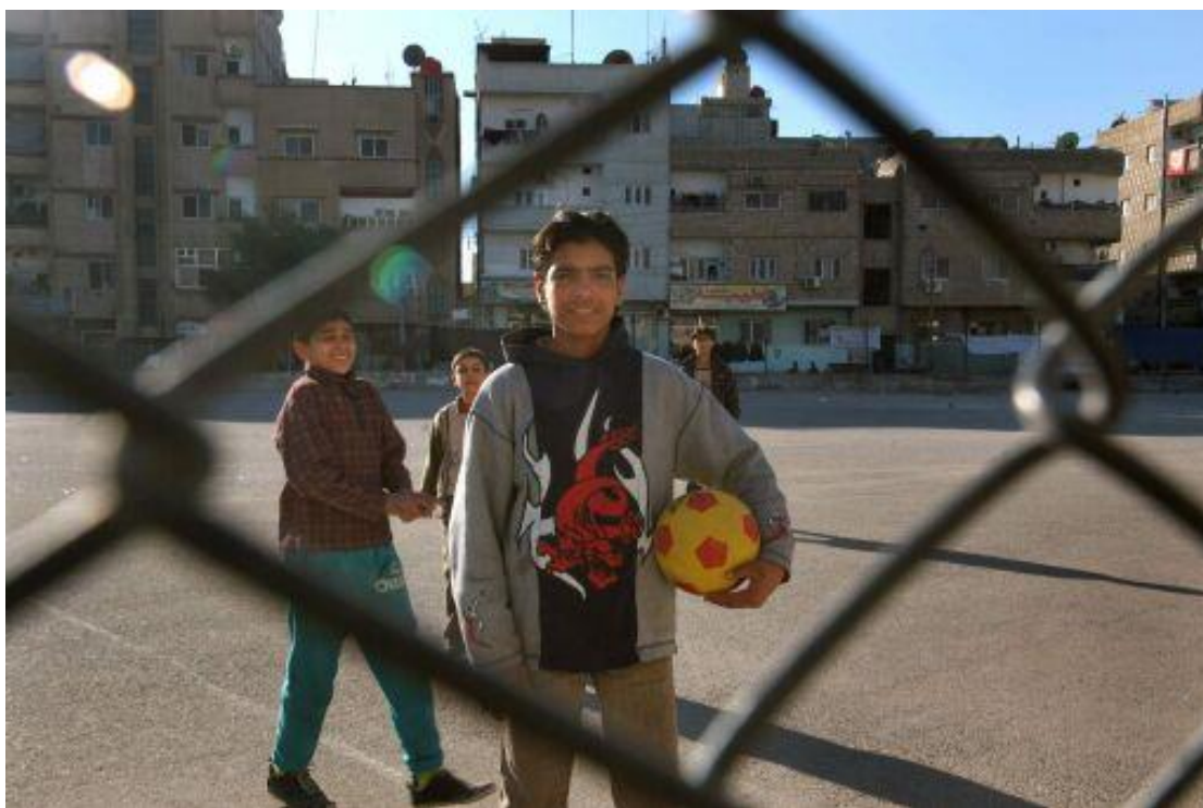
Young Iraqis playing football in a Damascus quarter, Syria © UNHCR/J.Wreford, January 2007

According to UNHCR and Syrian government officials, there are no restrictions preventing Iraqi children from attending schools in Syria. In June 2007 there were reported to be some 32,000 Iraqi children, aged between six and 18, attending public schools and about 1,000 children attending private schools. The total is low considering the estimated 1.4 million Iraqi refugees in Syria and the proportion of these who are likely to be children of school-going age. 22 Of the 33,000, some 30,000