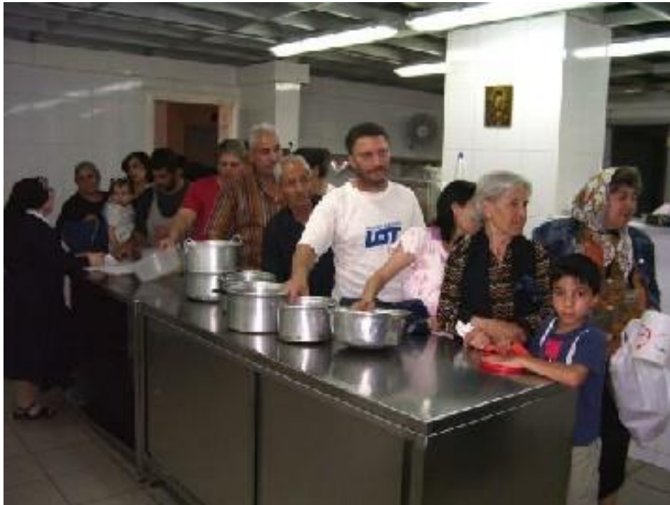
Iraqi families receive a cooked meal from a charity in the Jaramana district of Damascus, Syria, June 2007

When Iraqis cross the border their passports are stamped banning them from working. However, many Iraqis do take paid work illegally and they have become for local employers a cheap workforce. The Syrian authorities are aware of this and tolerate it. They have also taken advantage of the presence of professionals such as medical doctors, teachers and engineers among the Iraqi refugees by issuing them with work permits and allowing them to take jobs in Syria.