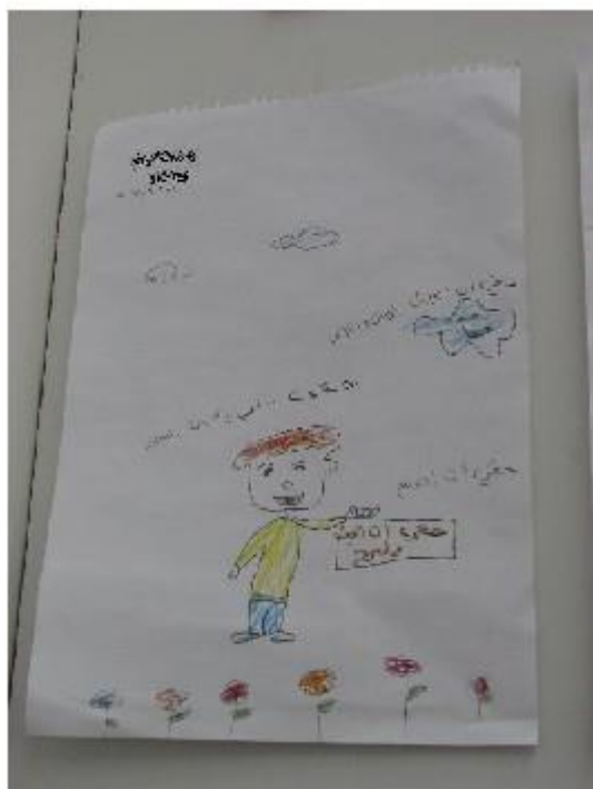
A drawing by an Iraqi child in Damascus with the Arabic writing saying, "I have the right to live in security and peace, I have the right to learn. I have the right to play and have fun." Syria, © AI, June 2007

Interviewed by Amnesty International in June 2007 in Syria