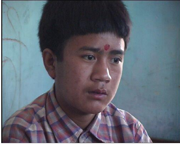
Former child soldier at The Sahara Children's rehabilitation home, Nepal.