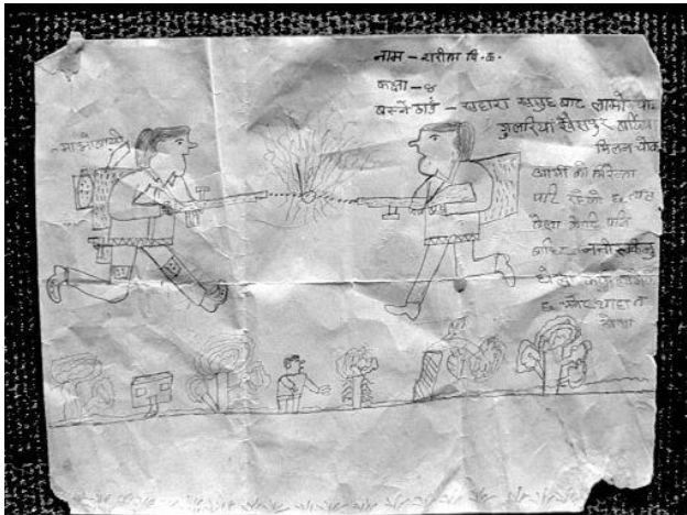
Fighting between the CPN (Maoist) and Royal Nepalese Army, drawn by a child at The Sahara Children's rehabilitation home for child victims of conflict. Nepalgunj.