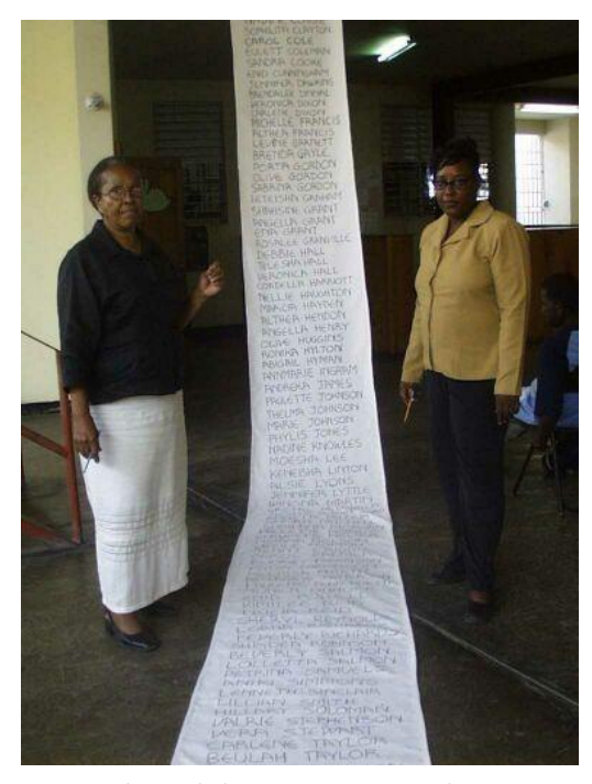
Women's activists stand alongside a scroll with the names of the women and children murdered in 2004.

tacitly accepted, <sup>15</sup> many children carry weapons <sup>16</sup> and criminals enter schools to carry out attacks – most girls have witnessed violence at school <sup>17</sup> and many have been victims. <sup>18</sup>