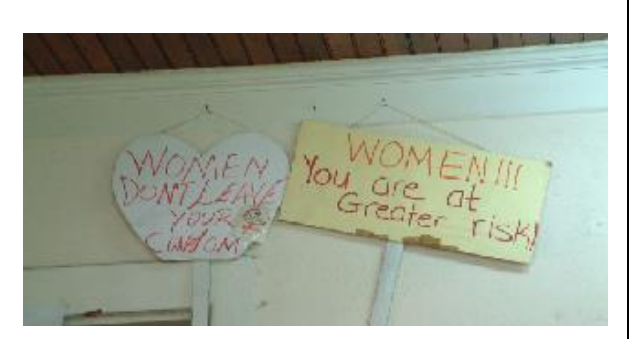
NGO placards encouraging safer sexual practices. \odot AI

Other forms of violence against women also contribute. Tentative evidence suggests that women find it more difficult to negotiate condom use and to use condoms consistently with a violent partner <sup>74</sup>: "Women's susceptibility to HIV is exacerbated by unequal power between women and men and the use of violence to sustain that power, which limits women's ability to negotiate safe sex." <sup>75</sup>