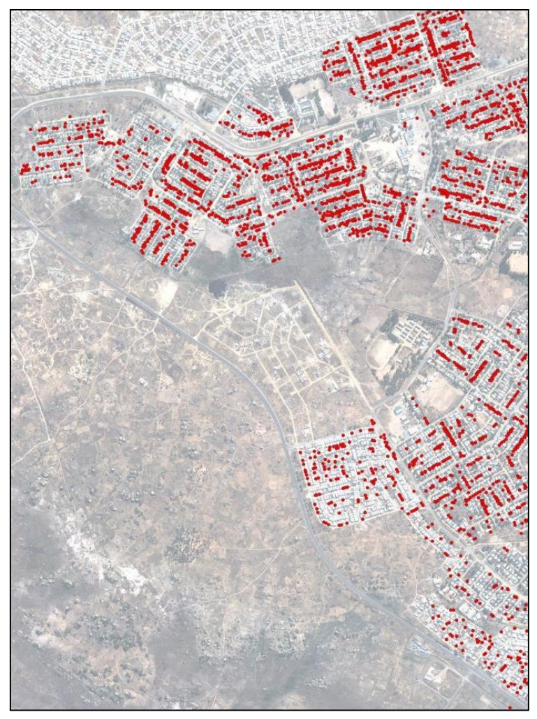
Figure 10: Chitungwiza Structure Count Chitungwiza on 22 June 2005 with centre points of the 2470 removed structures.

Analysis of the satellite images shows more than 2,000 backyard structures were removed in the portion of Chitungwiza captured by the satellite image. In addition, at least one marketplace in Chitungwiza was destroyed during the operation. In total, analysis of the satellite imagery indicates that 2470 structures were removed from this portion of Chitungwiza during Operation Murambatsvina. The size of structures themselves varied quite widely, with small backyard homes measuring 4 meters on a side and larger market structures measuring up to 40 square meters and more.