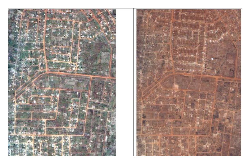
Figure 3: Hatcliffe Extension New Stands Before and After Operation Murambatsvina High resolution satellite imagery of the Hatcliffe Extension New Stands settlement in Zimbabwe. More than 700 structures are visible in the before (left hand) image, most of which are absent from the after (right hand) image. Note that the significant difference in colour between the images is due to seasonality as the before image was captured during the dry season while the after image was acquired during the rainy season.

Four QuickBird images were obtained.<sup>7</sup> The first set of images (Figure 3) shows a "before" image from 14 May 2004 and an "after" image from 2 September 2005 of the area of Hatcliffe Extension known as Hatcliffe Extension New Stands. The satellite imagery clearly shows the settlement in 2004 while the 2005 image shows most homes removed.