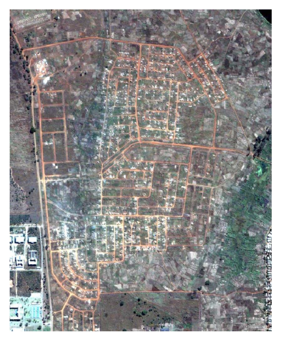
Figure 4: Hatcliffe Extension New Stands – 14 May 2004 Images (C) COPYRIGHT 2006 DigitalGlobe, Inc. ALL RIGHTS RESERVED.