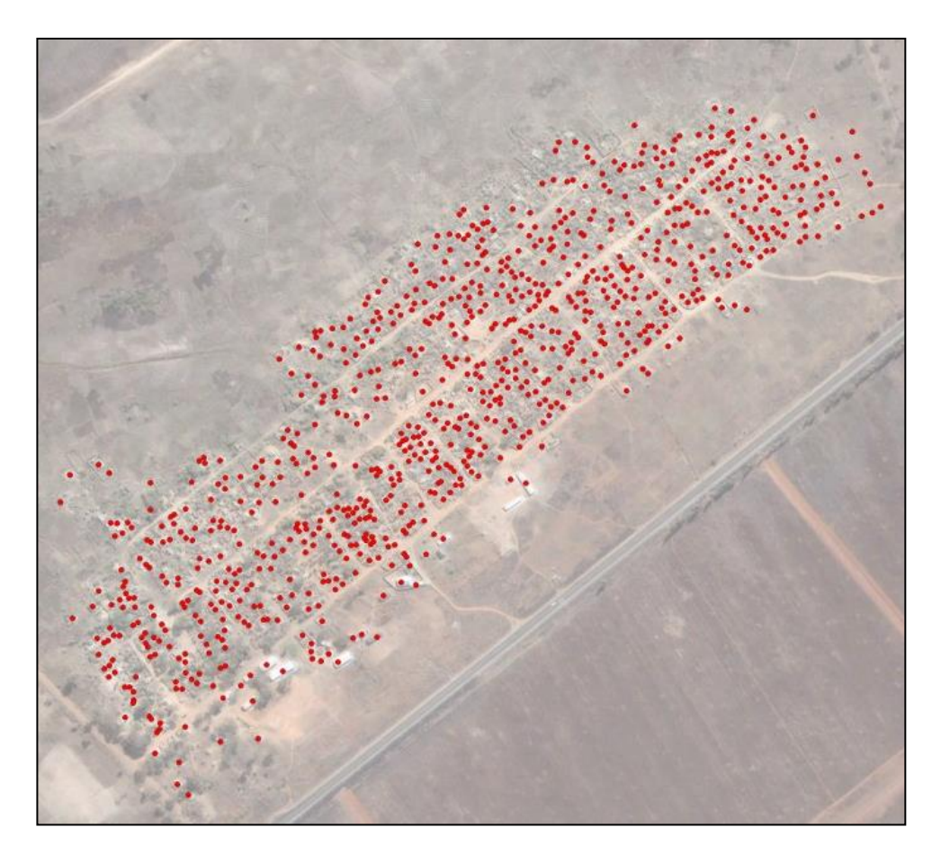
Figure 2: Porta Farm Structure Count The Porta Farm settlement with centre points of destroyed structures.