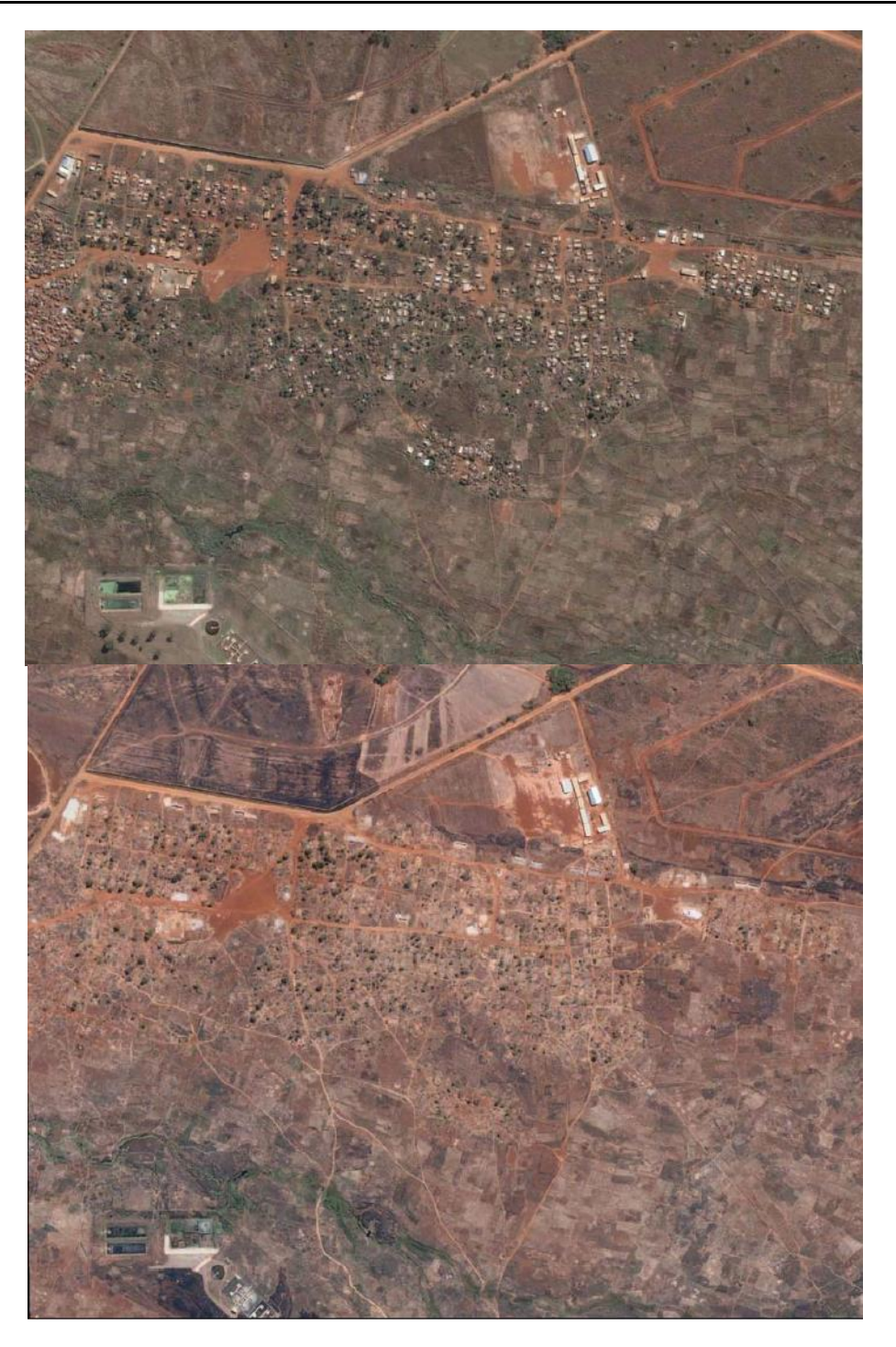
Figures 6 and 7: Hatcliffe Extension Holding Camp Before and After Operation Murambatsvina These images show a "before" image from 14 May 2004 and an "after" image from 2 September 2005 of Hatcliffe Extension Holding Camp.