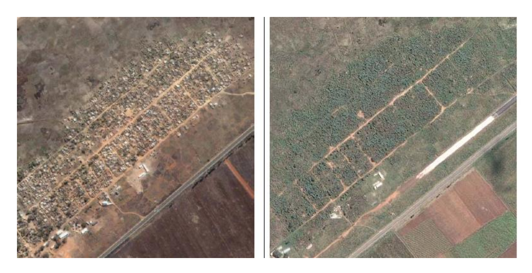
Figure 1: Porta Farm Before and After Operation Murambatsvina

High resolution satellite imagery of the Porta Farm settlement in Zimbabwe. More than 850 structures are visible in the before (left hand) image, practically all of which are absent from the after (right hand) image. Note that the significant difference in colour between the images is due to seasonality as the before image was captured during the dry season while the after image was acquired during the rainy season.