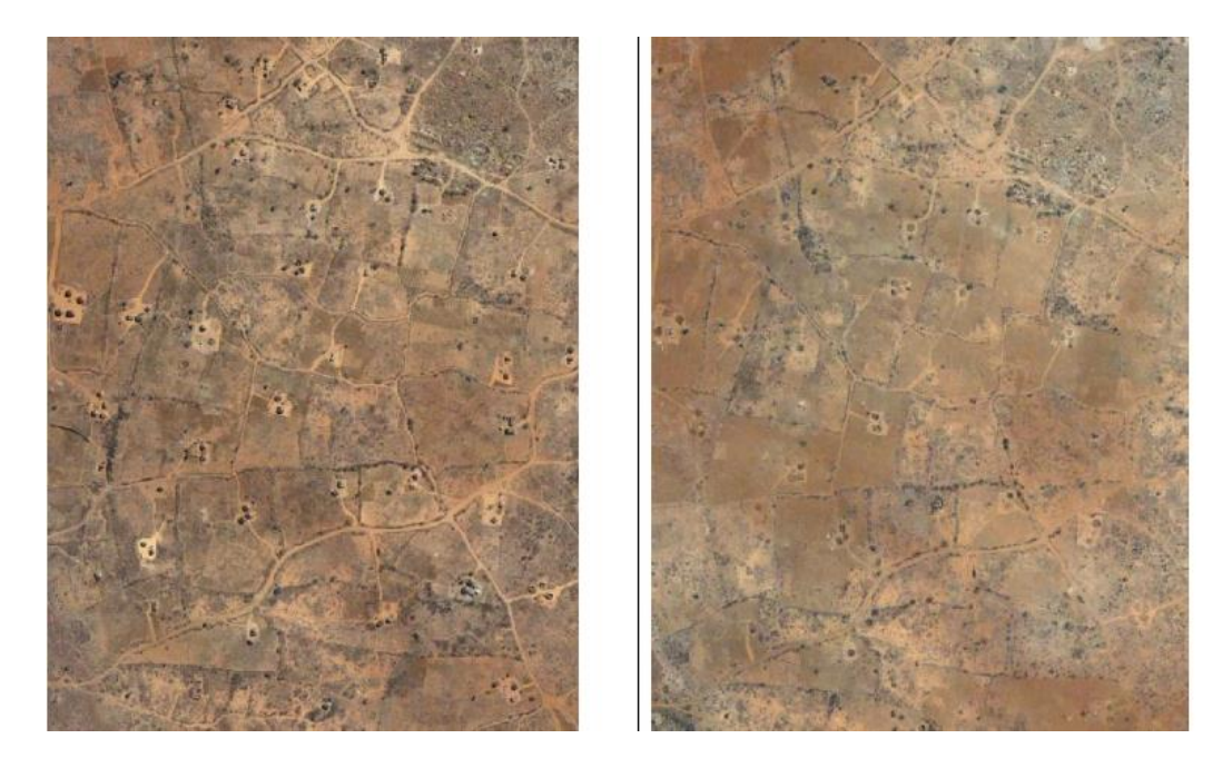
Figure 11: Killarney Before and After Operation Murambatsvina

The informal settlement at Killarney, outside Bulawayo, was destroyed in June 2005 as part of Operation Murambatsvina. Two QuickBird images were obtained covering the area including a "before" image from 22 August 2004 and an "after" image from 7 September 2005.<sup>9</sup> The satellite imagery clearly shows the settlement in 2004 while the 2005 image shows most homes removed.