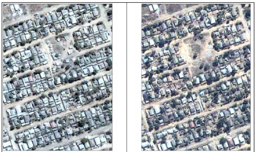
Figure 9: Chitungwiza Before and After Operation Murambatsvina A subset of the high-resolution satellite imagery of Chitungwiza town in Zimbabwe. Backyard homes are visible in the left-hand (before) image and are the smaller structures found on the periphery and in the alleys of larger structures, which are absent from the right-hand (after) image. In addition, what appears to be a marketplace seen in the "before" image is absent from the after image.

Analysis of the images indicates widespread demolition of backyard homes. Backyard homes were essentially built on small patches of land leased to renters by owners of larger, permitted structures (see Figure 9). Amnesty International researchers visited the St. Mary's area in August 2005, at which time the evidence of the demolitions was widespread. Almost every house in St. Mary's was surrounded by the brick rubble of destroyed backyard structures. Foundation slabs were clearly visible in many cases, and people were evidently living in the gardens and on verandas.