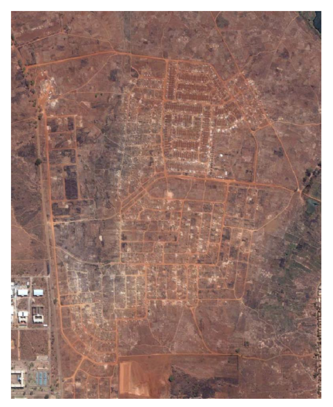
Figure 5: Hatcliffe Extension New Stands – 2 September 2005