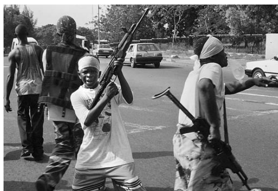
A former government child soldier fires into the air, Monrovia, 19 December 2003.

There are an estimated 21,000 child soldiers in Liberia. A peace agreement signed in August 2003 and the UN Security Council's decision the following month to deploy a large peace-keeping operation offered hopes of finally ending the conflict. An urgent and adequate response to the plight of these children is necessary to reinforce Liberia's peace process and also contribute to stability in the West Africa region, scarred by years of conflict and insecurity.