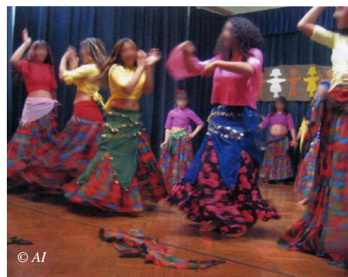
Romani children from Slovenia dancing.

curricula and to the preparation of textbooks and other teaching materials.