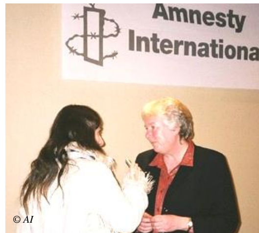
AI delegate discussing issue of torture with a Georgian journalist.

There were allegations that at least in some cases investigations were excessively protracted and failed to bring perpetrators to justice.