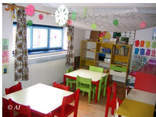
A pre-school in Čakovec, Croatia, attended by Romani children.

Members of Romani communities in Croatia lacked full access to primary education, especially in geographical areas not covered by existing governmental and other programmes to promote the inclusion of Roma in education.