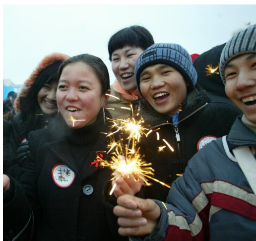
Index: EUR 01/017/2006)

Activists mark their opposition against the death penalty in Bishkek which is the first city in Central Asia that joined global initiative Cities For Life - Cities against the Death Penalty in 2006.