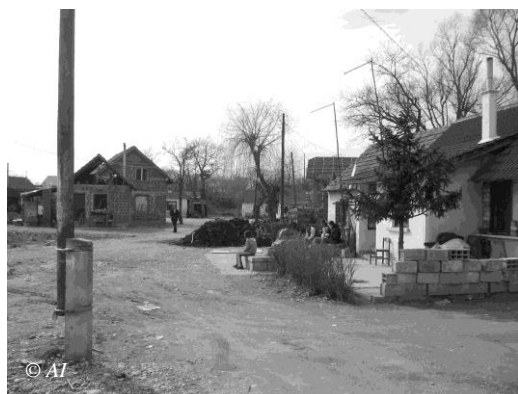
A settlement in Croatia.

At least 300,000 Croatian Serbs left Croatia during the 1991-95 war, of whom only approximately 125,000 are officially registered as having returned. This figure is widely considered to be an overestimation of the real numbers of those who have returned and remained in Croatia.