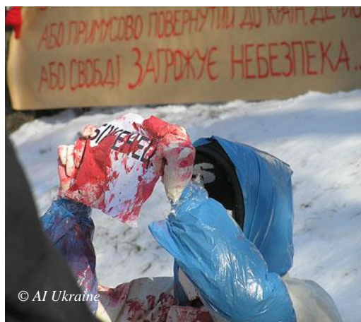
AI group in Ukraine protested against the forcible return of Uzbekistani refugees by the Ukrainian authorities.

detention centre, according to the Uzbekistani authorities. A criminal investigation had reportedly been launched into the men's participation in the Andizhan events. Although the authorities reportedly had given diplomatic assurances to their Kyrgyzstani counterparts that international organizations, including representatives of the UN, would have access to the men after their return, this had not been granted by the end of the year.