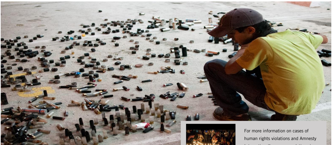
Spent cartridges in Táchira State, March 2014