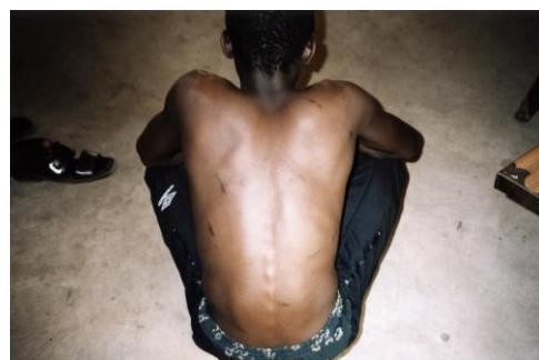
A prison inmate who says he was tortured by the police.

The Nigerian Police frequently use torture while interrogating suspects, despite section 34 of the Nigerian Constitution, article 7 of ICCPR and the Convention against Torture. In a study published in 2000 the Nigerian Human Rights Commission and the NGO Centre for Law Enforcement (CLEEN) stated that almost 80 percent of inmates in Nigerian prisons claim to have been beaten by