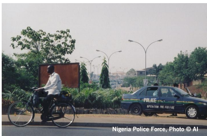
Nigeria Police Force, Photo © AI

Amnesty International welcomes the adoption by the House of Representatives of the motion ‘Upsurge in cases of Armed Robbery and Shooting of Nigerian in South Africa’, on 17 April 2008 and the adoption by the Senate of a motion ‘Armed Robbery and Violent Attacks on Nigerian in South Africa: Time for Decisive action’ on 23 April 2008. Extra-judicial executions and torture are a serious concern for Amnesty International in many parts of the world, including Nigeria.