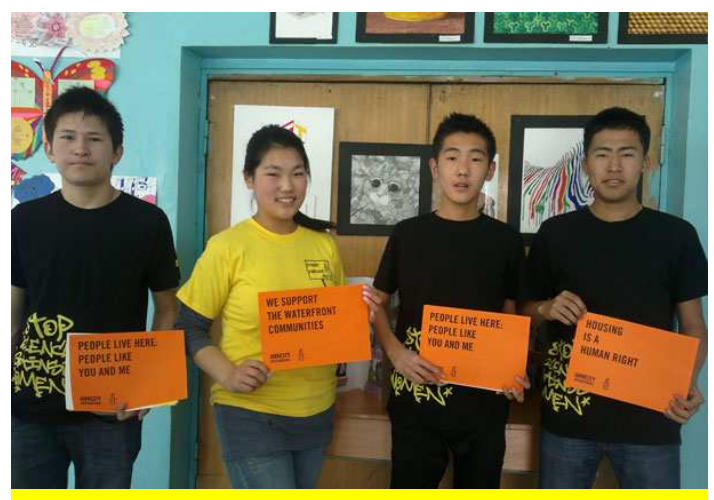
TAKING ACTION FOR HUMAN RIGHTS!

In Mongolia , workshops allowed students to learn about and promote housing rights . Human Rights Friendly Schools in Mongolia regularly integrate Amnesty International's Demand Dignity Campaign activities in the classroom. Teachers use topics such as clean water, housing rights, maternal health to engage with students on human rights issues.