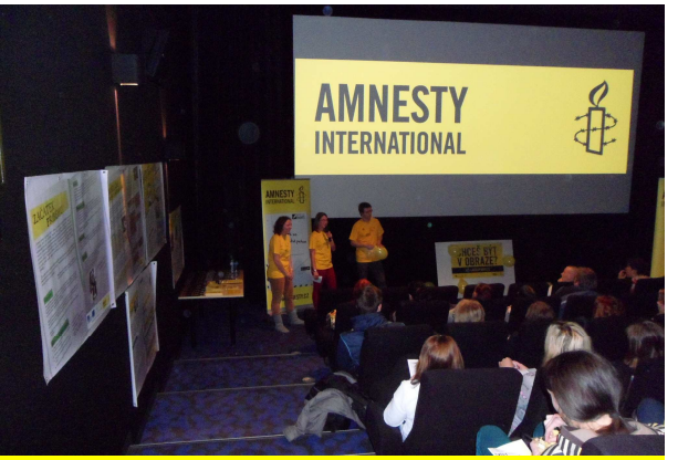
Amnesty Cinema created by Human Rights Friendly Schools in Czech Republic, March 2013.

On 13 March 2013, Human Rights Friendly Schools in Czech Republic launched its 'Amnesty Cinema Event' to promote and launch the Human Rights Friendly School project.