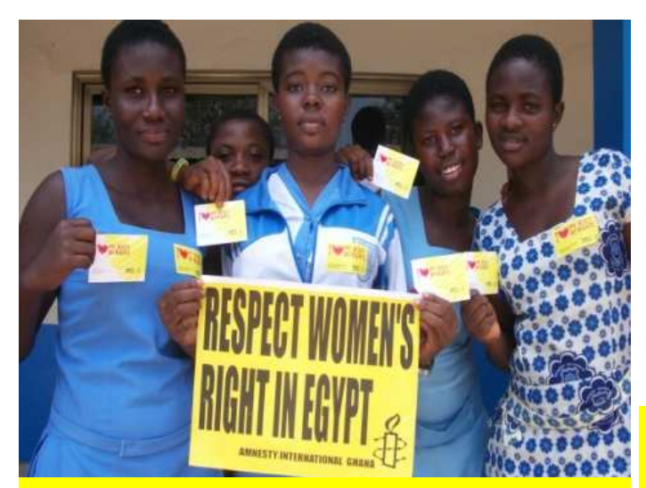
Students of the Human Rights Friendly School Hwediem Senior High School in Ghana taking action for My Body, My Rights campaign, February 2013

In Senegal , students from the Human Rights Friendly School Lycée Saint Louis took action to prevent illegal migration . In Saint Louis, northern Senegal, fishing is one of the main industries. Finding it increasingly difficult to live off of their fishing wages, many young people illegally emigrate to the Canary Islands and mainland Spain. This journey is extremely dangerous, with thousands of people dying before reaching Europe. This campaign targeted national, municipal and local town authorities, as well as women and the wider population, in order to ensure respect for the rights of young people, their right to employment and their right to life. Theatre plays were presented to raise awareness on the difficulties of the journey and of the new life people are faced with once in Spain.