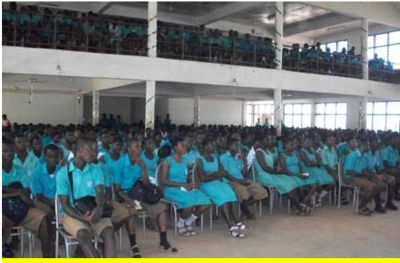
Students of Hwediem Senior High School attending an induction seminar to the Human Rights Friendly Schools project, in Brong Ahafo Region, Ghana, February 2013

Amnesty International Ghana has been an active participant in the Human Rights Friendly Schools project since its inception. Starting with one school in 2009 and increasing to six by 2012, Amnesty International Ghana is now partnering with 10