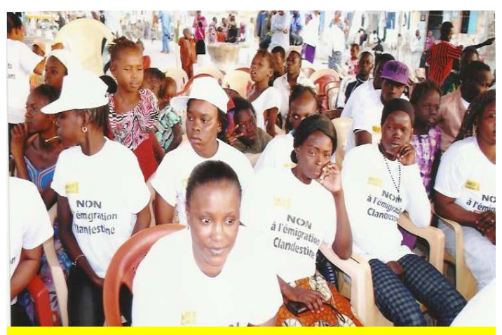
Students of the Human Rights Friendly School Lycée Satin-Louis taking action to raise awareness on illegal migration, Senegal, February 2013.

In Senegal , students from the Human Rights Friendly School Lycée Saint Louis took action to prevent illegal migration . In Saint Louis, northern Senegal, fishing is one of the main industries. Finding it increasingly difficult to live off of their fishing wages, many young people illegally emigrate to the Canary Islands and mainland Spain. This journey is extremely dangerous, with thousands of people dying before reaching Europe. This campaign targeted national, municipal and local town authorities, as well as women and the wider population, in order to ensure respect for the rights of young people, their right to employment and their right to life. Theatre plays were presented to raise awareness on the difficulties of the journey and of the new life people are faced with once in Spain.