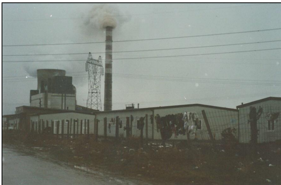
Plemetina Collective Centre in the shadow of the KEK power station

respect to employment in public bodies...". 168 This is particularly noticeable in view of the large number of members of minority groups, particularly those who have completed a university education, who are employed elsewhere in the international community by international NGOs in both professional posts and – even if they are overqualified for such posts – as drivers or translators. M.K. reported that almost every one of the 143 Serb adults living in the Yu-building in Priština/Prishtinë was employed by the international community. 169