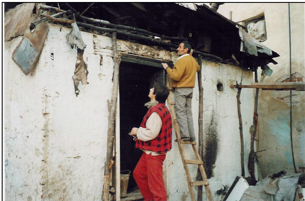
A Roma man salvages what he can from the remains of his brother's house

International delegates met a man 214 whose brother's family had planned to return to two houses within the Roma mahala . He was salvaging what he could from the wreckage of one of the properties, both of which had been burned a few weeks after his brother had announced his intention to return, despite 24-hour KFOR patrols and floodlighting of the area introduced after two other houses had been burned following the house-holders' expressed intentions to return.