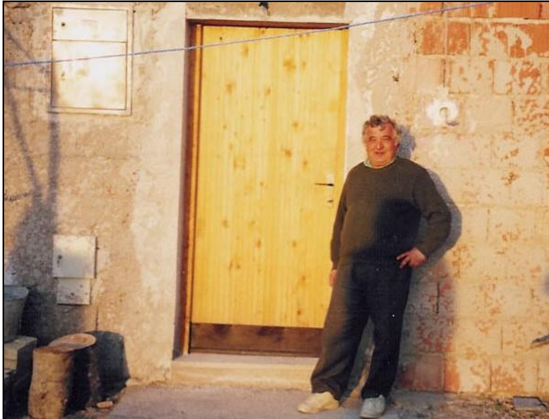
Returnee standing outside the house he rebuilt, Osojane/Osojan, March 2002

of returnees were reportedly unable or unwilling to rebuild their own houses, and so paid ethnic Albanian labourers were being escorted into Osojane/Osojan each day to work on the reconstruction of the houses. 220 Although some returnees were working on rebuilding the ambulanta and the school, little agricultural work had taken place, despite the donation of a tractor and other materials by the Serbian Coordination Committee. Returnees continued to depend on humanitarian aid, much of it imported from Serbia.