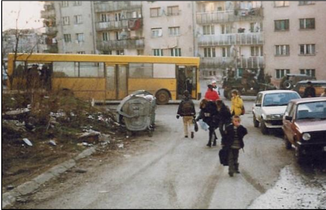
Serb children being escorted home from school by KFOR, Priština/Prishtinë February 2002

For minority children living outside the enclaves, going to school often means a KFOR-escorted journey of several kilometres. The 20 elementary-school age children, living in the Yu-building in Priština/Prishtinë, are escorted daily to the osnova skola at Laplje Selo/Llapiasellë, eight kilometres away, while the four older children are driven a few more kilometres to the srijedna skola (secondary school), in Gračanica/Ulpiana. The children travel to and from school in a bus escorted by Greek or Swedish KFOR. This pattern is repeated elsewhere throughout Kosovo, except in enclaves where minorities have set up their own "parallel" education system outside of that financed and administered by UNMIK. 156