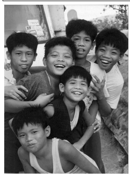
A group of former street children who have been helped by children's NGO PREDA and are now leading successful lives.

"In all actions concerning children, whether undertaken by public or private social welfare institutions, courts of law, administrative authorities or legislative bodies, the best interests of the child shall be a primary consideration." (Article 3 (1), CRC)