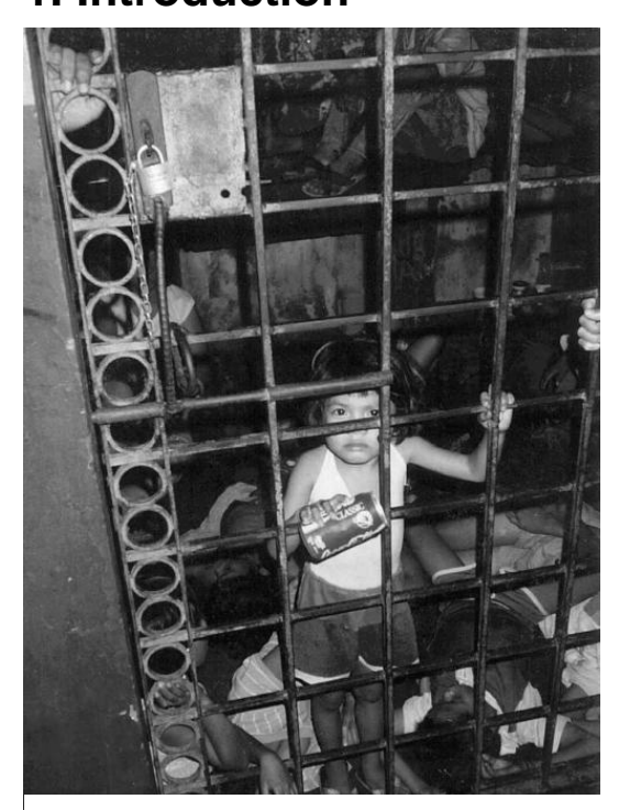
Police arrested this five-year old girl after they found her wandering the streets. She was held in detention with adults for 16 hours before child rights advocates secured her release.

Children<sup>2</sup> in the Philippines, as in all societies, are uniquely vulnerable due to their incomplete physical, emotional and intellectual development. They are dependent on adults and adult structures of political and economic power to safeguard their well-being. This combination of vulnerability and dependency is particularly striking for those children facing the adult world of law, detention and criminal justice.