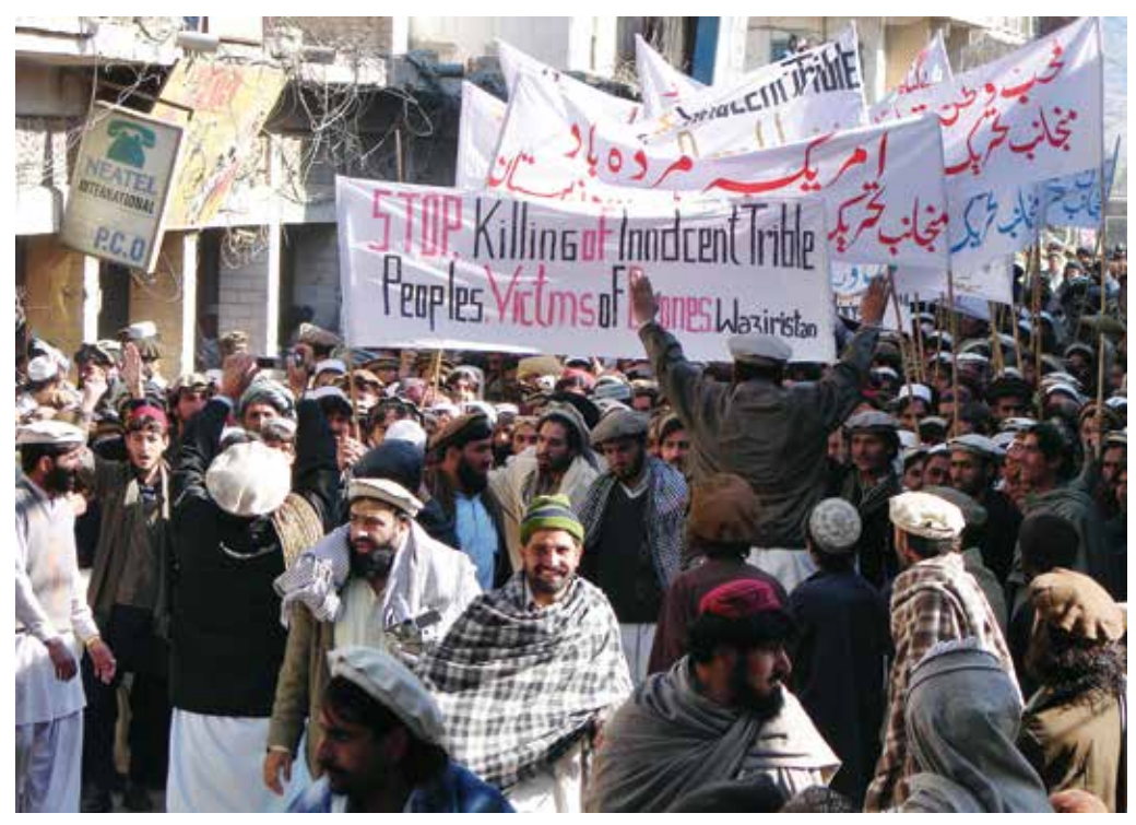
Pakistani tribesmen hold banners as they march during a protest rally against the US drone attacks, in Miranshah, the main town in North Waziristan district on January 21, 2011.