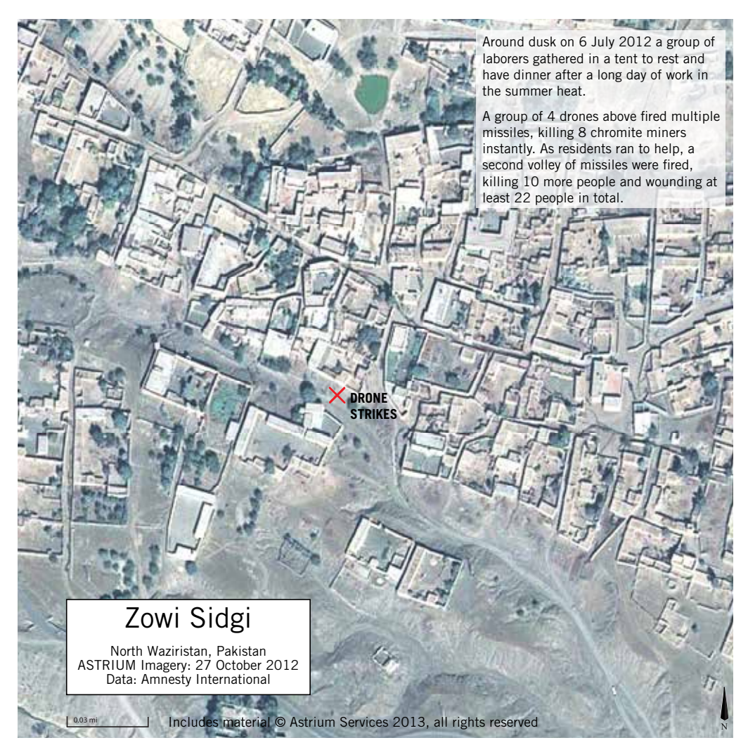
A satellite image of Zowi Sidgi taken in October 2012. It shows the exact location of the first US drone strike that killed at least 8 people on 6 July 2012. A second strike near the same area appears to have targeted 'rescuers', killing a further 10 people.w