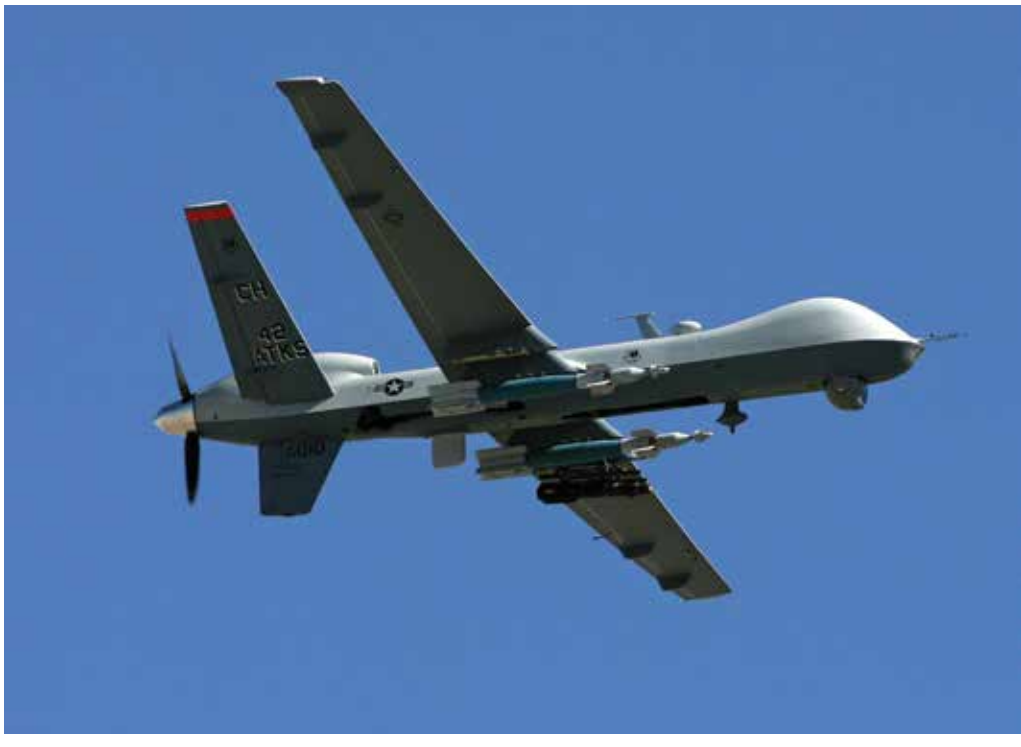
Reaper Drone: One of the types of drones used by the United States in Pakistan.

Amnesty International does not have comprehensive data on the total number of US drone attacks or the numbers killed and injured, and is not in a position to endorse the findings of others. Below is a table of current estimates for the period 2004 to 2013 gathered from various sources.