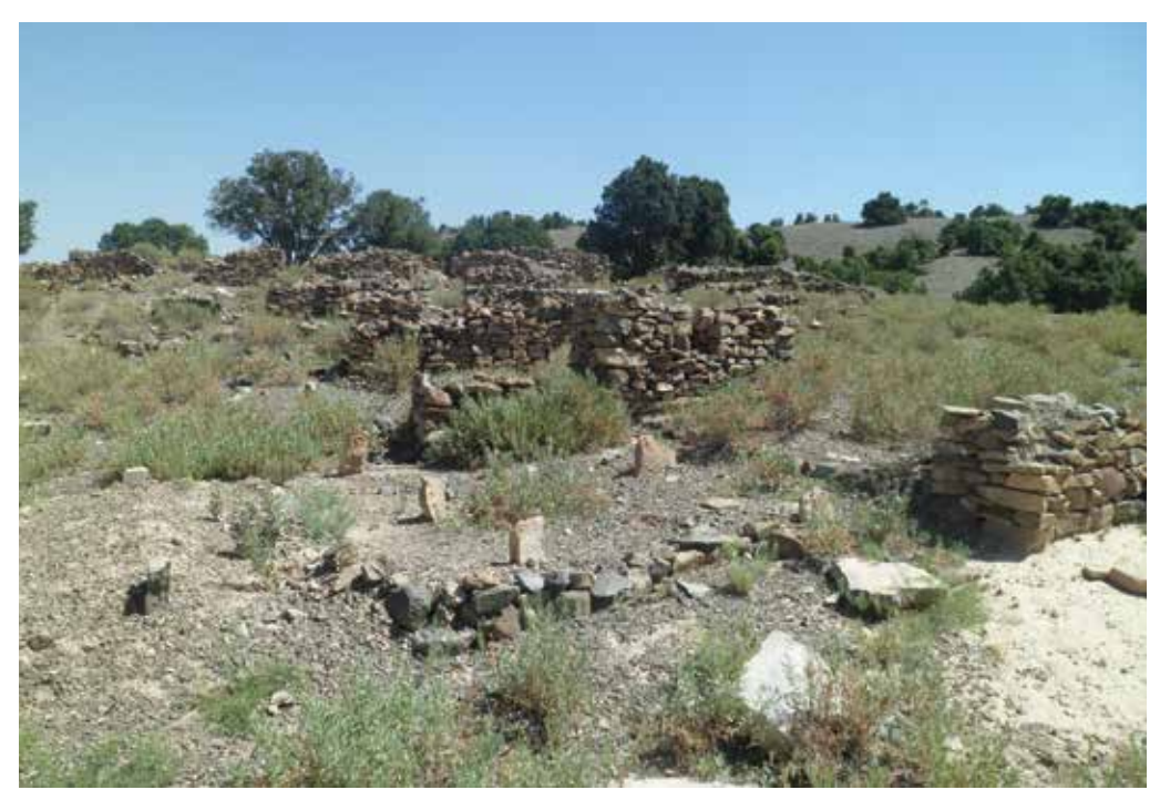
Some of the graves of people killed in a US drone strike on Zowi Sidgi in July 2012. Like all of the cases documented in this report, the US authorities have yet to acknowledge these killings.

Amnesty International believes it is highly unlikely that any US drone strikes in Pakistan satisfy the law enforcement standards that govern intentional use of lethal force outside armed conflict. Whether or not the individuals or groups targeted are considered enemies of the USA, or have carried out or planned crimes against US nationals or others, their deliberate killing by drones outside an armed conflict would therefore very likely violate the prohibition of arbitrary deprivation of life and may constitute extrajudicial executions. Unlawful and deliberate killings carried out by order of government officials or with their complicity or acquiescence amount to extrajudicial executions; they are prohibited at all times and constitute crimes under international law.<sup>106</sup> Deliberate killings by drones, taking place outside armed conflict, without first attempting to arrest suspected offenders, without adequate warning, without the suspects offering armed resistance, and in circumstances in which suspects posed no immediate risk to security forces, would be considered extrajudicial executions in violation of international human rights law.<sup>107</sup>