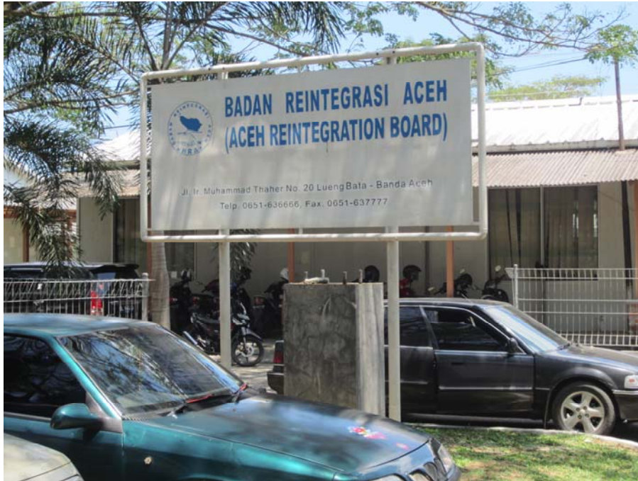
Office of the Aceh Reintegration Agency (BRA) in Banda Aceh which implemented an extensive reintegration and assistance programme following the 2005 peace agreement.

Amnesty International acknowledges that the Indonesian government has taken measures to provide financial and other material assistance to victims of the Aceh conflict. However, during interviews in May 2012 NGO workers, victims' representatives and others expressed concerns about the unclear and difficult process in place for "conflict victims" to access the assistance scheme. The definition of "conflict victims" was a problem in itself as it was not well defined. Further the requirements to access the BRA scheme were challenging to implement in practice for a number of reasons. Firstly, some victims/survivors explained that they did not feel brave enough to report to the local authorities what had happened to them and claim access to the scheme. Others explained that it was difficult to show proof of what had happened to them. In particular, it was difficult for torture victims (including victims/survivors of sexual violence, see Chapter 5.3 below) to be recognized as such if their injuries were not physically visible. Lastly, some victims stressed that it was particularly challenging for those who were not located near certain local authorities and for those living in isolated communities to access the scheme.