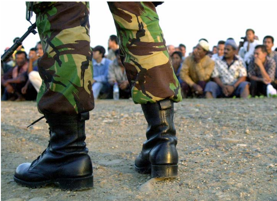
An Indonesian soldier guards villagers during a security search in Pusong village in Indonesia's Aceh province on 18 July 2003.