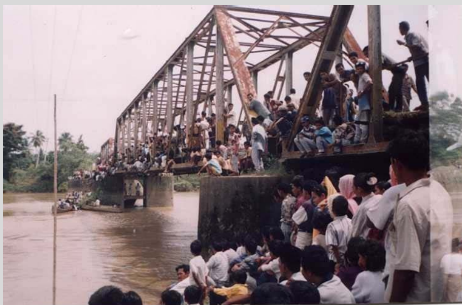
Villagers gather at Arakundo Bridge to search the bodies of those killed by Indonesian security forces on 3 February 1999 in Idi Cut, East Aceh .

Just after midnight on 3 February 1999, members of the military (Linud 100 battalion) opened fire on thousands of people who were returning home after attending a “preaching” ( dakwah ) rally at the Matang Ulim village in Idi Cut, East Aceh. The action appears to have been carried out in retaliation for the kidnapping and killing of ten army personnel in Lhok Nibong by unidentified persons on 29 December 1998.