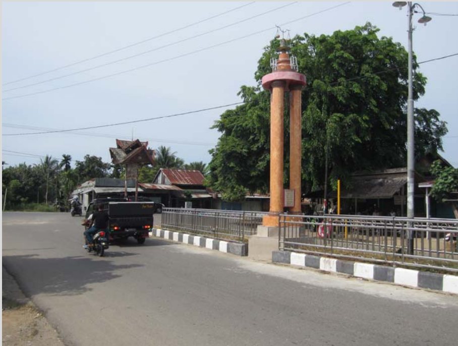
Monument erected at the location of the Simpang KKA in North Aceh to remember those who were killed when soldiers opened fire on 3 May 1999.

On 3 May 1999, dozens were killed when military personnel opened fire at a crossroads near the Kertas Kraft Aceh (KKA) pulp and paper mill, known widely as Simpang KKA , at Cot Morong village in Dewantara sub-district in North Aceh.