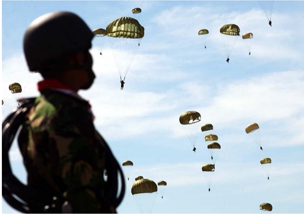
An Indonesian soldier watches as hundreds of Indonesian airborne soldiers parachute into an area in Central Aceh on 20 May 2003.

As in previous military campaigns against GAM, the security of the civilian population was paid scant regard. The security forces forcibly displaced civilians from their homes and villages, carried out armed raids and house-to-house searches and destroyed houses and other property. The Indonesian military failed to distinguish between combatants and non-combatants. Young men were frequently suspected by the security forces of GAM membership and were particularly at risk of human rights violations, including unlawful killing, torture and other ill-treatment, and arbitrary detention. Some members of GAM were also unlawfully killed after being taken prisoner. Women and girls were subjected to rape and other forms of sexual violence. Trials of hundreds of individuals suspected of being members of or supporting GAM contravened international standards for fair trials, including because suspects were denied access to legal representation and were forced to confess guilt under torture. Civilians, including children, were forced to support military operations. 48