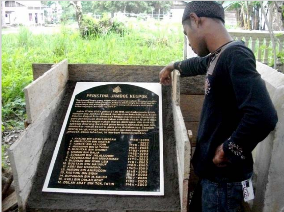
Graves and memorial of those who were shot dead or burned to death by Indonesian security forces at Jamboe Keupok, South Aceh on 17 May 2003.

On the morning of 17 May 2003, dozens of soldiers including Kopassus and Raider units arrived in three trucks at the village of Jamboe Keupok in South Aceh district. They rounded up everyone at the village and separated the men from the women and children. The military then started beating the men in front of the women and children. The women and children were taken to a school building in the village and locked up there. The soldiers then shot and killed four villagers. They took 12 men, whose hands were tied, to a house nearby, where they were locked up. The soldiers then poured oil around the house and set it on fire. From the school the women and children heard the men shouting followed by gunfire. After the military left, the women came out and found the burned remains of the 12 men in the house. 143 Amnesty International is not aware of any investigation into this case.