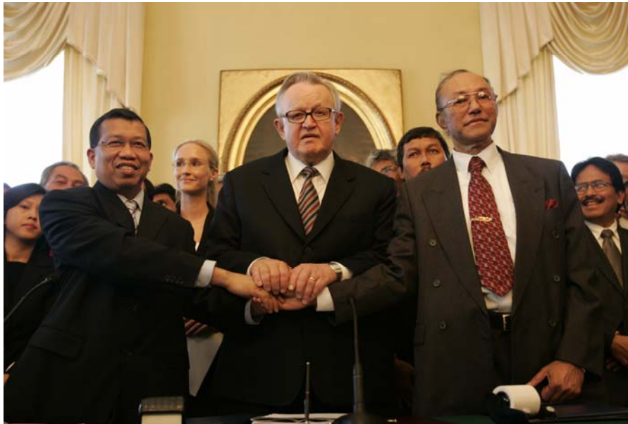
Indonesia's Law and Human Rights Minister Hamid Awaluddin (L) shakes hands with the GAM Chairman Malik Mahmud (R) in the presence of Finland's former president Martti Ahtisaari (C) after the signing of the peace agreement on 15 August 2005.

With the election of President Susilo Bambang Yudhoyono in September 2004, a new approach to the situation in Aceh began to develop. 51 Informal talks resumed between representatives of the Free Aceh Movement and the Indonesian government. 52 The December 2004 earthquake and tsunami accelerated the peace negotiations. The Free Aceh Movement eventually agreed to drop its demands for independence, while the Indonesian government accepted a comprehensive reintegration and amnesty programme for former GAM combatants, the formation of local political parties, and new security arrangements in Aceh. 53