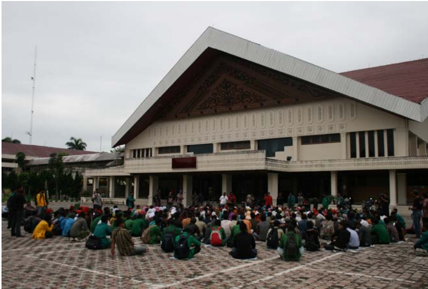
Victims/ survivors of the Aceh conflict demonstrate for the establishment of a truth commission outside the Aceh House of People's Representatives, December 2010.

More than seven years after the end of the conflict, the national and local authorities are failing to take effective measures to establish the truth about abuses committed during the conflict. Victims and their families are being denied information about the abuses committed against them, including the fate and whereabouts of disappeared and missing persons. Many of those interviewed by Amnesty International in May 2012 stressed that it is essential that the truth about what happened in the past is established so that new generations can learn about it. Many victims emphasized the need to ensure that what happened during the Aceh conflict would be part of the curriculum so that young people in Aceh would learn about it, so that the past would not repeat itself.