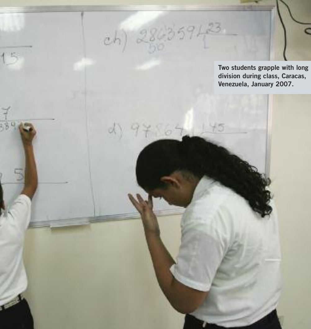
Two students grapple with long division during class, Caracas, Venezuela, January 2007.