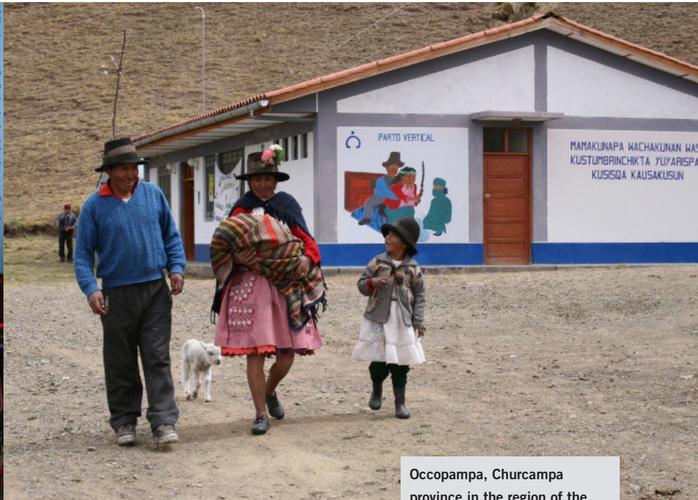
Occopampa, Churcampa province in the region of the Huancavelica, June 2007. left: Giving birth in a vertical position is a traditional method used in Andean Peru. In 2005 the Ministry of Health issued guidelines on the use of this method in order to ensure that health professionals offered this option to women. centre: Before and after the birth, women can rest in the company of their family in maternal waiting houses next to the health facility. right: A family leaving the health facility in Occopampa, with their new baby.

been perpetuated by the fact that people living in poverty do not have access to administrative processes that allow them to obtain legal identity documents. The lack of official documentation effectively restricts enjoyment of civil and political rights, such as the right to vote. It also denies people social and economic rights. For example, it limits access to the Seguro Integral de Salud (SIS, the Public Health Insurance Scheme) which allows women who live in poverty to access free maternal health care because identity documents are required to register with the SIS. The 2007 census of Indigenous Peoples reported that 14.9 per cent of the population aged 18 and above covered by the census did not have national identity papers. The percentage is higher for women (18.1 per cent) than for men (12.2 per cent). 42