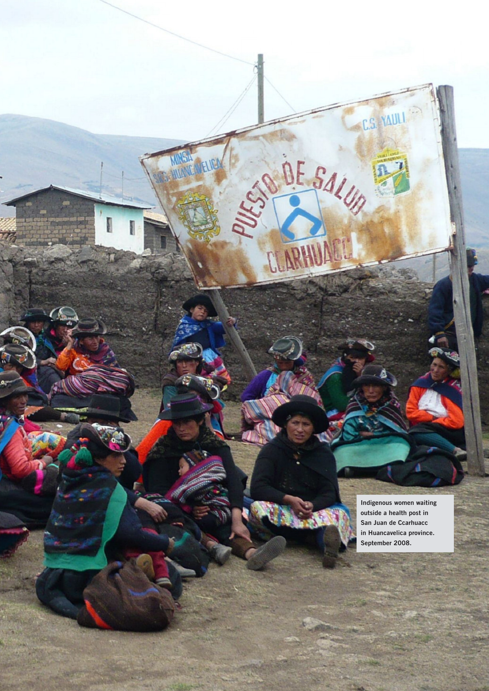
Indigenous women waiting outside a health post in San Juan de Ccarhuacc in Huancavelica province. September 2008.