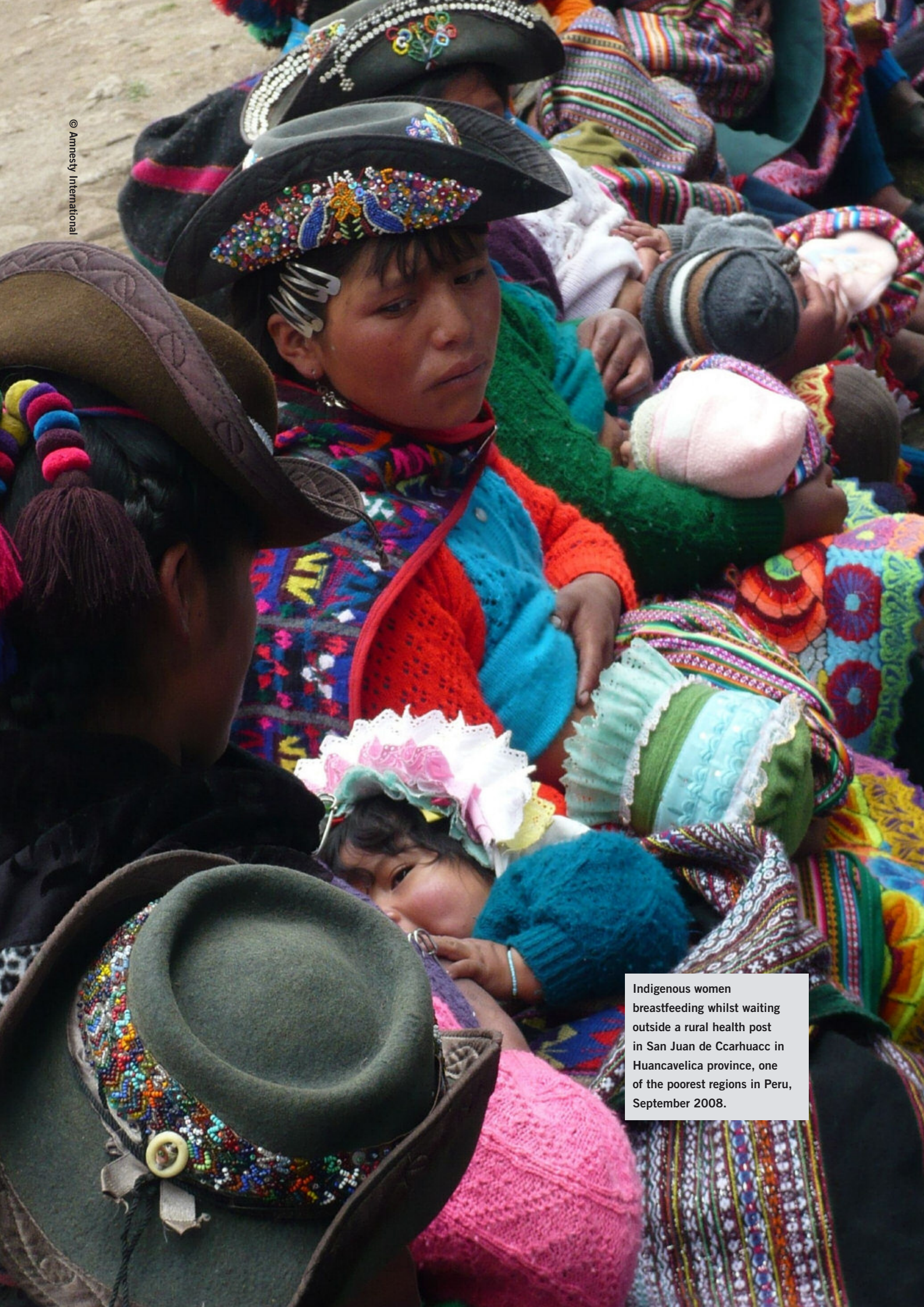
Indigenous women breastfeeding whilst waiting outside a rural health post in San Juan de Ccarhuacc in Huancavelica province, one of the poorest regions in Peru, September 2008.