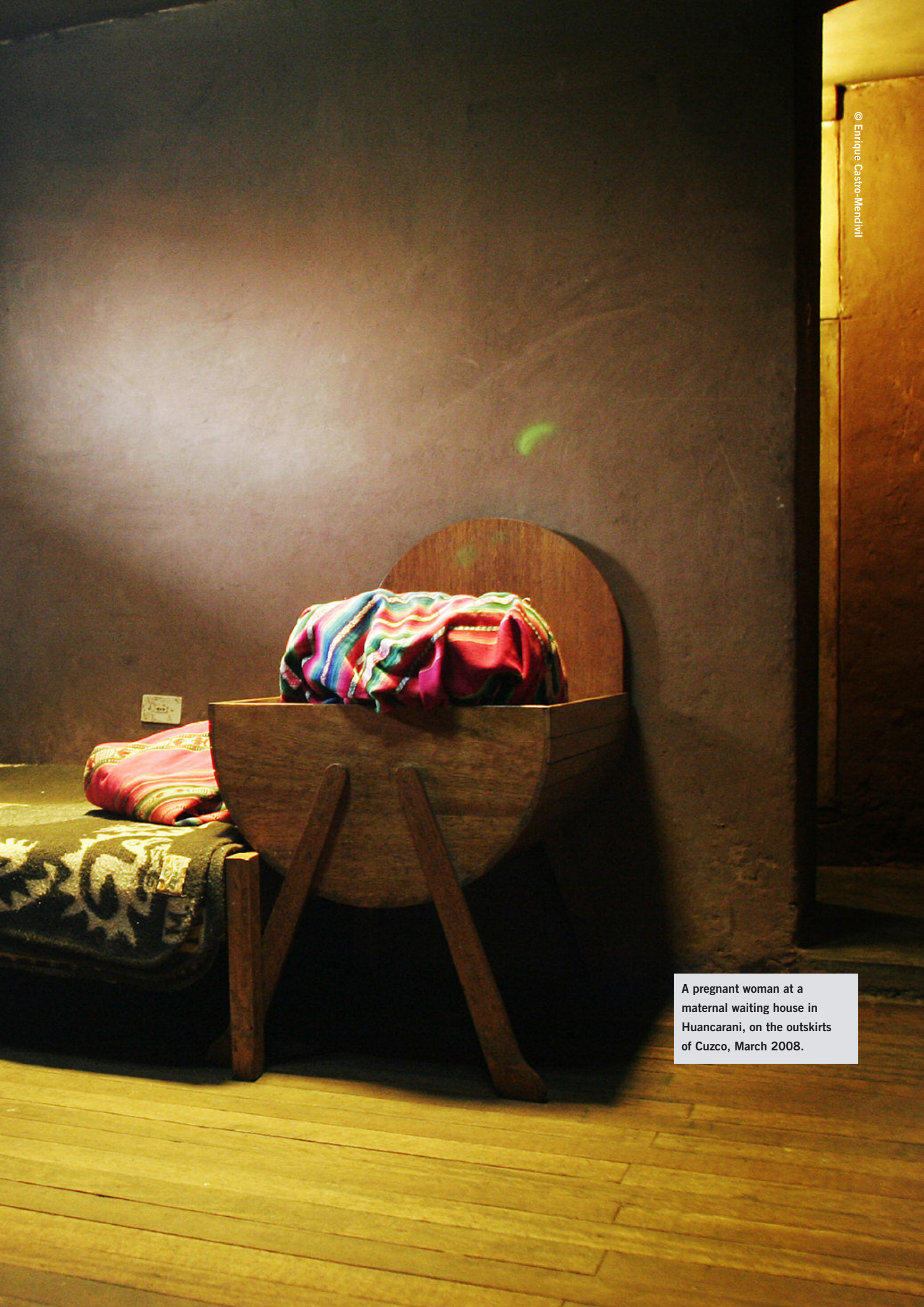
A pregnant woman at a maternal waiting house in Huancarani, on the outskirts of Cuzco, March 2008.