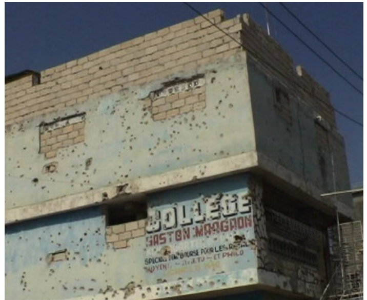
Bullet-riddled walls of a college in Port-au-Prince damaged during heavy fighting in the area between armed gangs and MINUSTAH during 2006.

During her visit to Haiti in 1999, the Special Rapporteur on violence against women, its causes and consequences, Radhika Coomaraswamy, found that “following the military coup d’état, Haitian women continue to suffer from what some interlocutors referred to as ‘structural violence’, targeted at the most vulnerable and poor.” 6 She also reported that between November 1994 and June 1999, the Ministry of Women’s Affairs and Women’s Rights registered 1,500 cases of girls