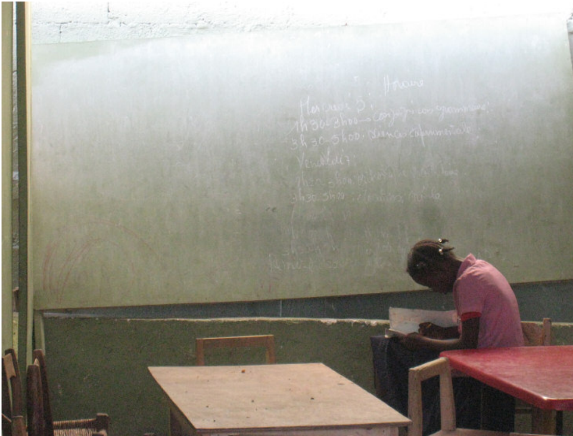
A schoolgirl copies homework from the board, Port-au-Prince, Haiti.

In July 2005, the transitional government adopted a decree introducing minor but significant changes to Haiti's 1835 Penal Code. The Haitian press widely reported the government's intention to modify some articles of the Penal Code relating to rape in order to afford women and girls greater protection from sexual violence. However, despite the entry into force of the decree, 36 the government has yet to establish a legal framework and a national policy to protect women and girls from all forms of violence. Haiti remains the only country in the Americas that has not enacted specific legislation to protect women and girls from domestic violence and one of the few without specific legislation on sexual violence. 37