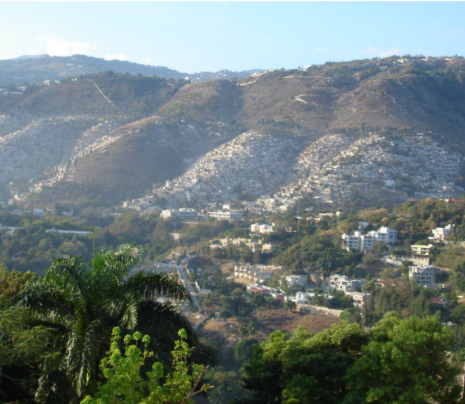
Outskirts of the Haitian capital, Port-au-Prince.