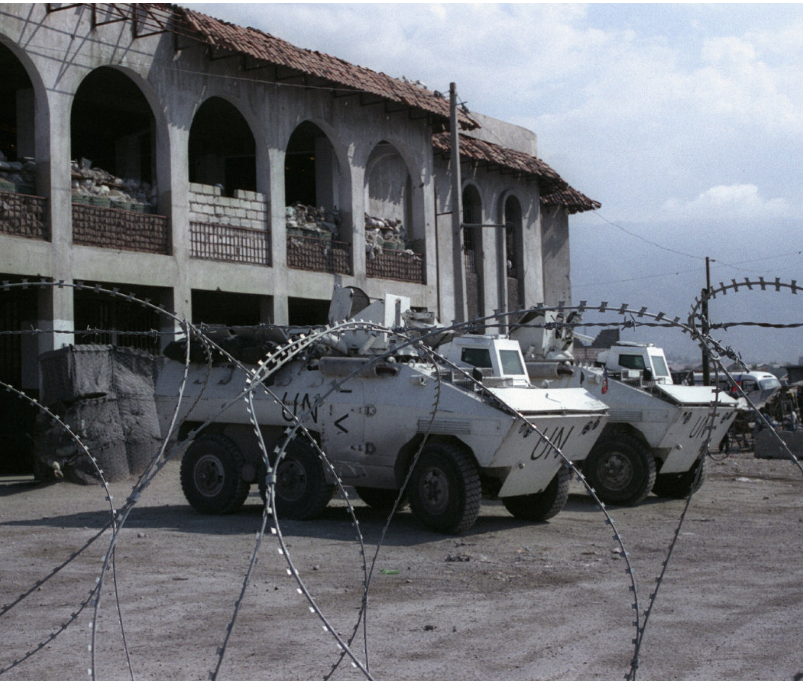
A UN base at the entrance of the Cité Soleil area of Port-au-Prince, Haiti. The base was set up to try to address high levels of gang violence in the area.