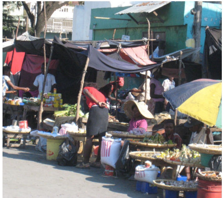
With high unemployment rates, street trading is one of the strategies adopted by many women to survive economic hardship, Port -au-Prince, Haiti.

The Haitian government has endorsed the 1995 Beijing Declaration and Platform For Action. This