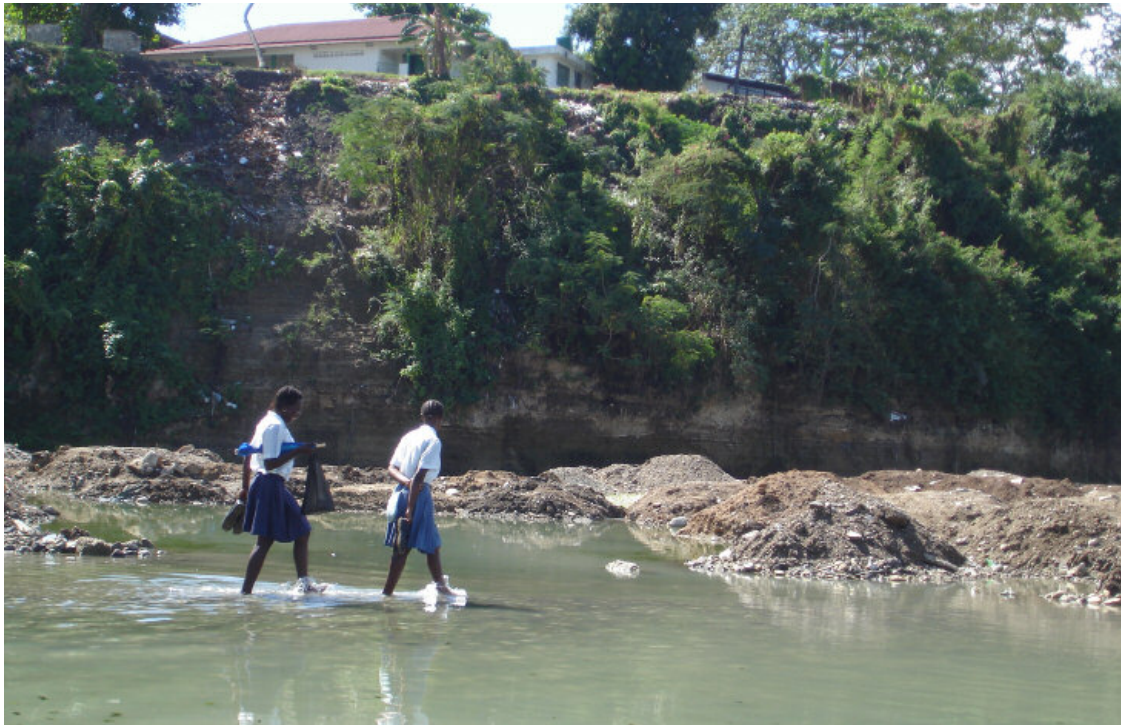
Girls crossing a river on the way to school, Lavanneau, Haiti.

indicate the dimension of the problem... In fact, it is not possible to know at national or regional levels how many women have filed complaints of violence, the outcome of these complaints and the current situation of the victim." 22 In its recommendations to the government, the study highlights the need for a single, unified mechanism for collecting and analysing information on violence against women. Since the study, a standardized form has been developed for use by all institutions in contact with girls and women who have experienced sexual violence. However, at the time of writing, implementation was in the very initial stages.