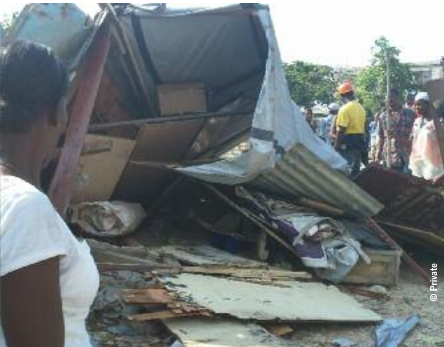
Left: Forced evictions at Camp Mozayik, Delmas municipality, Port-au-Prince, May 2012.