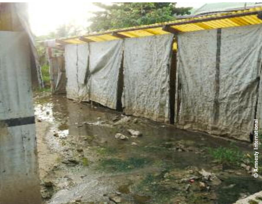
Left: Showers at Camp Grace Village, Carrefour municipality, Port-au-Prince.