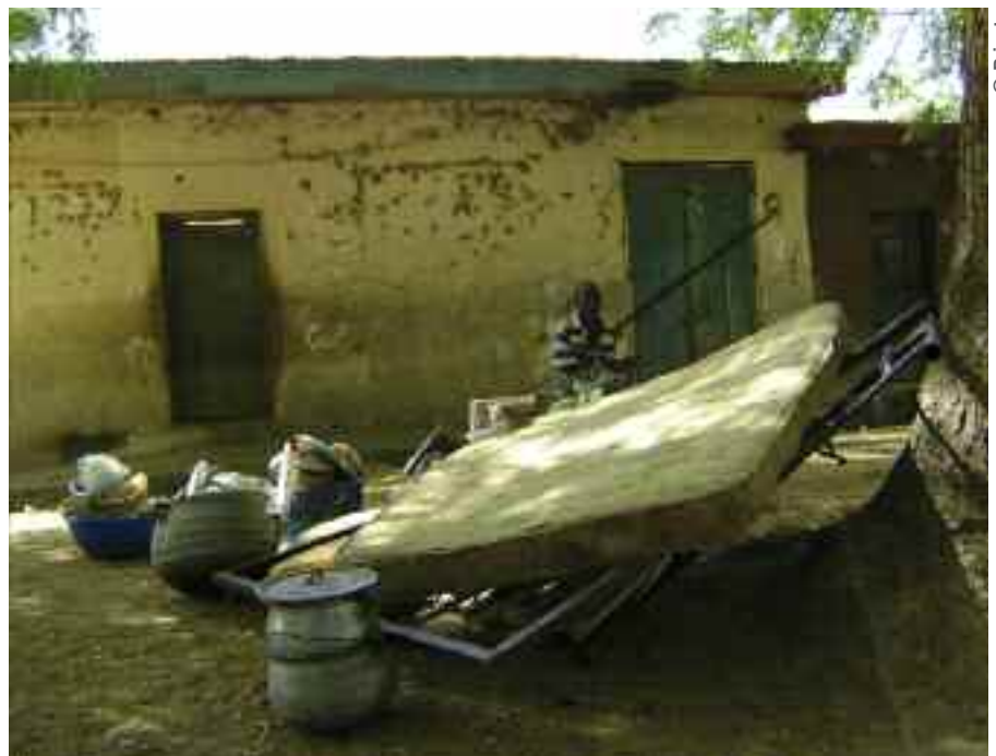
Right: Residents of Kwar Maila pile their belongings on the street ready to relocate after the JTF allegedly burnt down several homes in the area. None of the residents received any compensation.